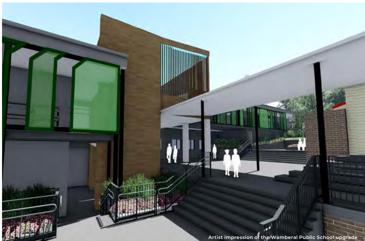
Artist impression of the Wamberal Public School upgrade

Construction work will take place Monday to Saturday, 7am to 5pm. No work will take place on Sundays or public holidays. We appreciate your patience as we complete these works as quickly as possible.