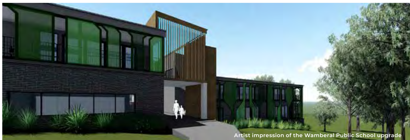
Artist impression of the Wamberal Public School upgrade