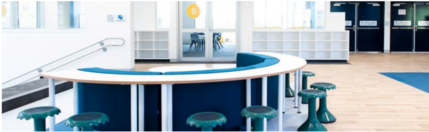
Waitara Public School upgrade