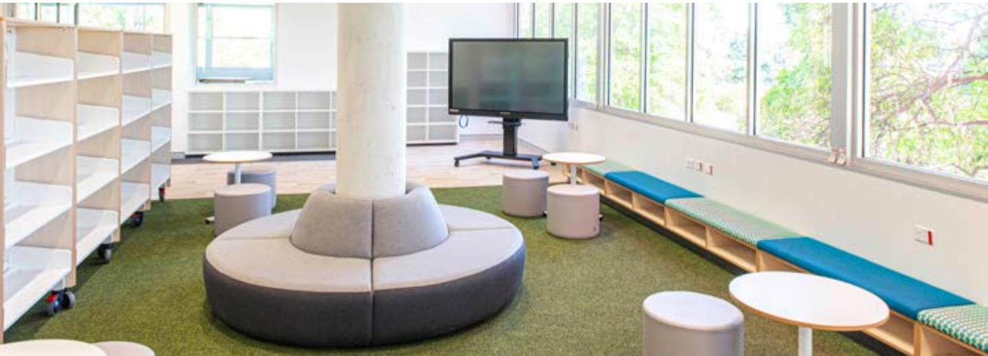
New innovative learning space at Waitara Public School