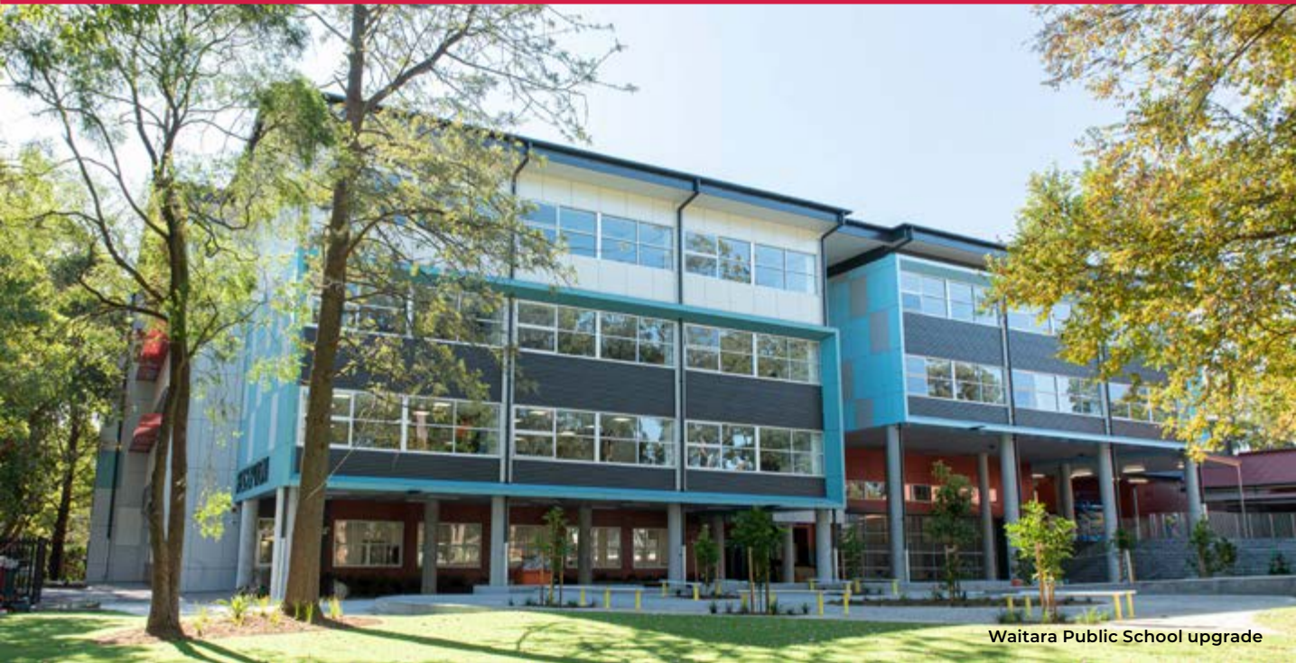
Waitara Public School upgrade