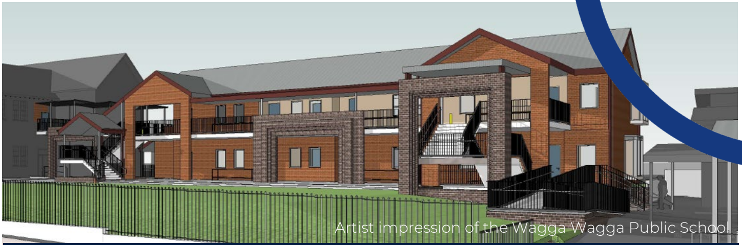
Artist impression of the Wagga Wagga Public School