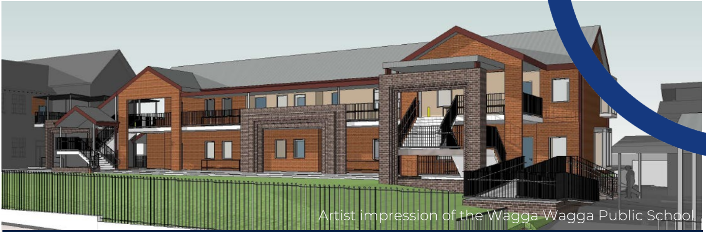
Artist impression of the Wagga Wagga Public School