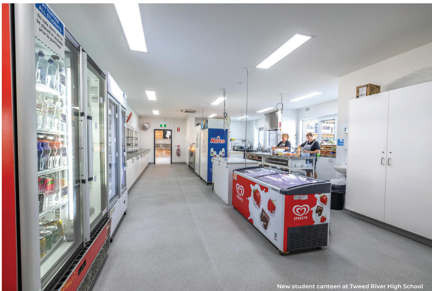
New student canteen at Tweed River High School