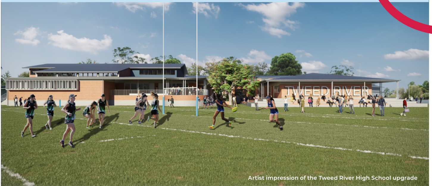
Artist impression of the Tweed River High School upgrade

The NSW Government is investing $7 billion over the next four years, continuing its program to deliver more than 200 new and upgraded schools to support communities across NSW. This is the largest investment in public education infrastructure in the history of NSW.