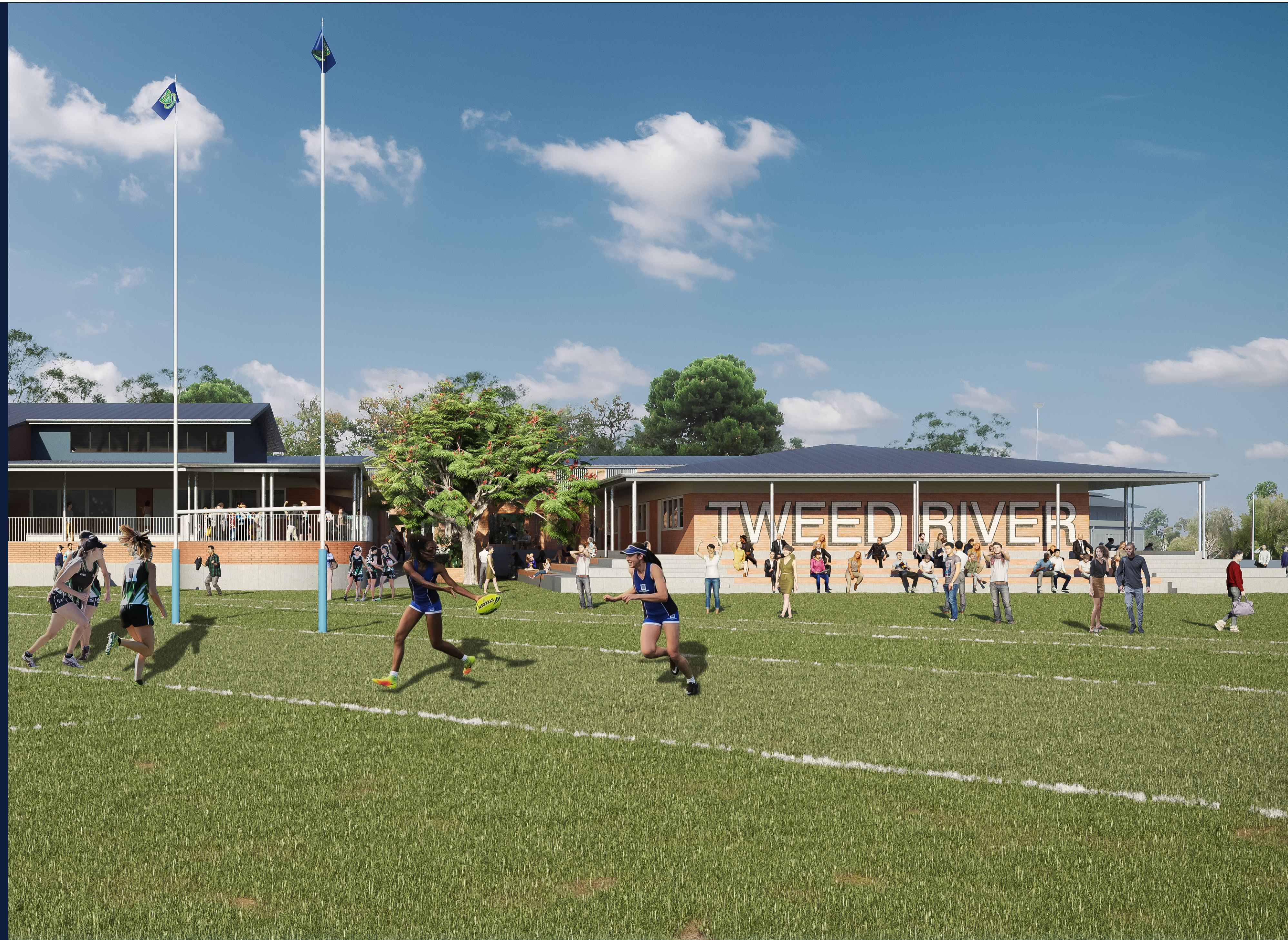
Artist impression of the Tweed River High School upgrade