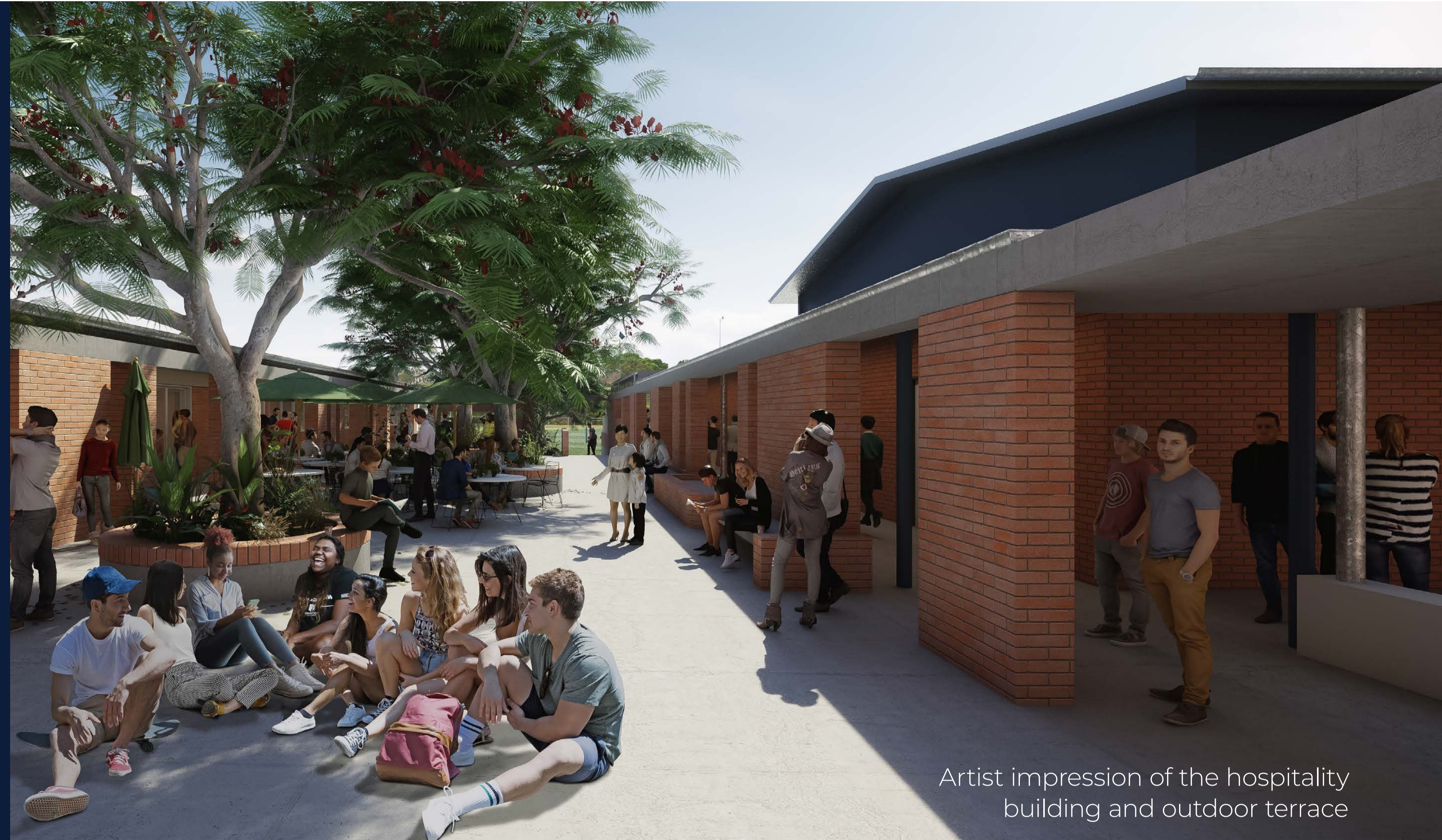
Artist impression of the hospitality building and outdoor terrace

To ensure the school gains the benefits of new facilities as soon as possible, the upgrade will be delivered progressively. In addition to the early works already completed, further new facilities will be ready for use by the school in late 2021, with the remainder being ready for use throughout 2022.