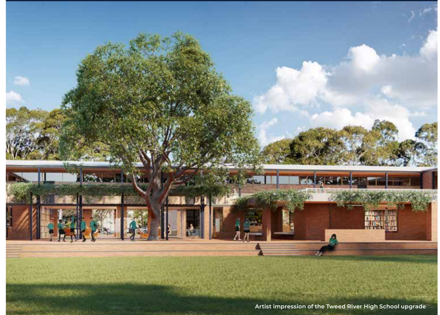
Artist impression of the Tweed River High School upgrade

A project is underway to upgrade Tweed River High School. The upgrade will include: