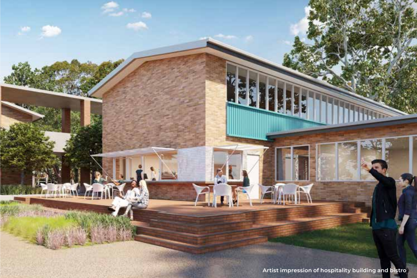
Artist impression of hospitality building and bistro