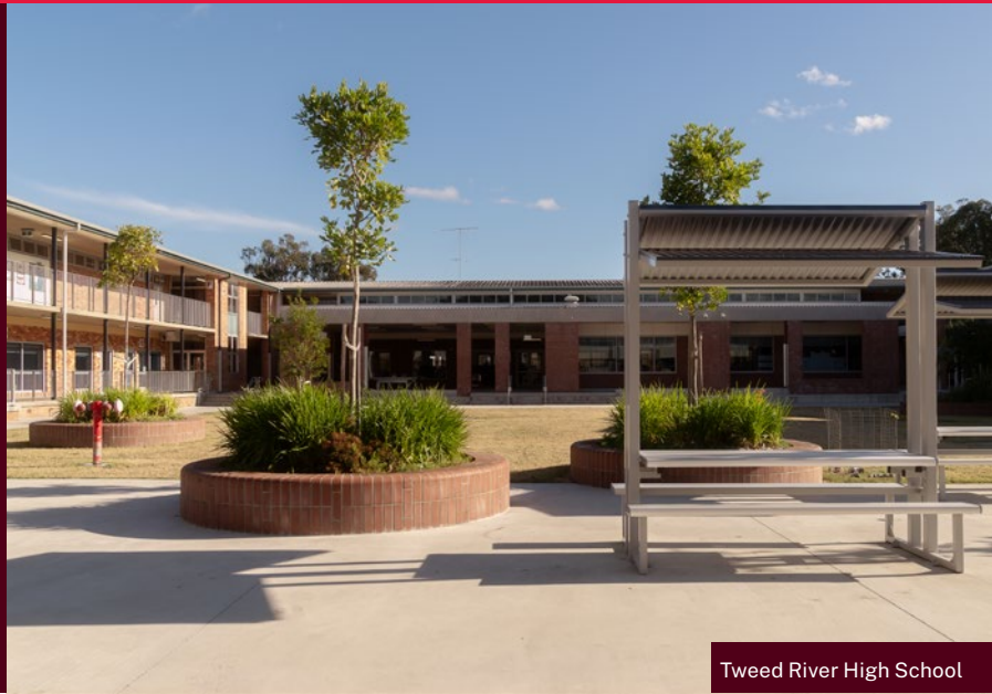
Tweed River High School