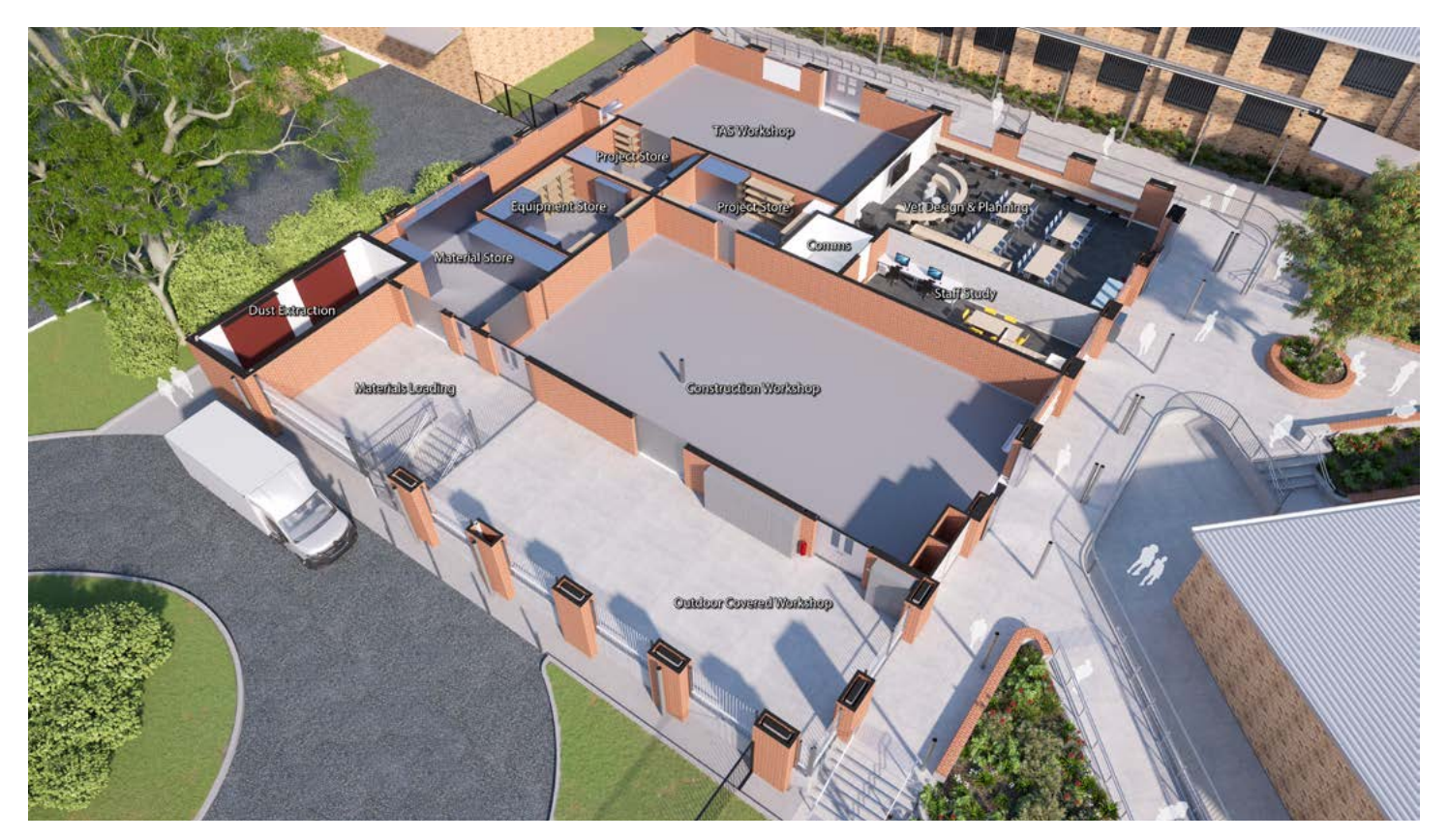
Artist impression of VET Construction and Technology Education spaces