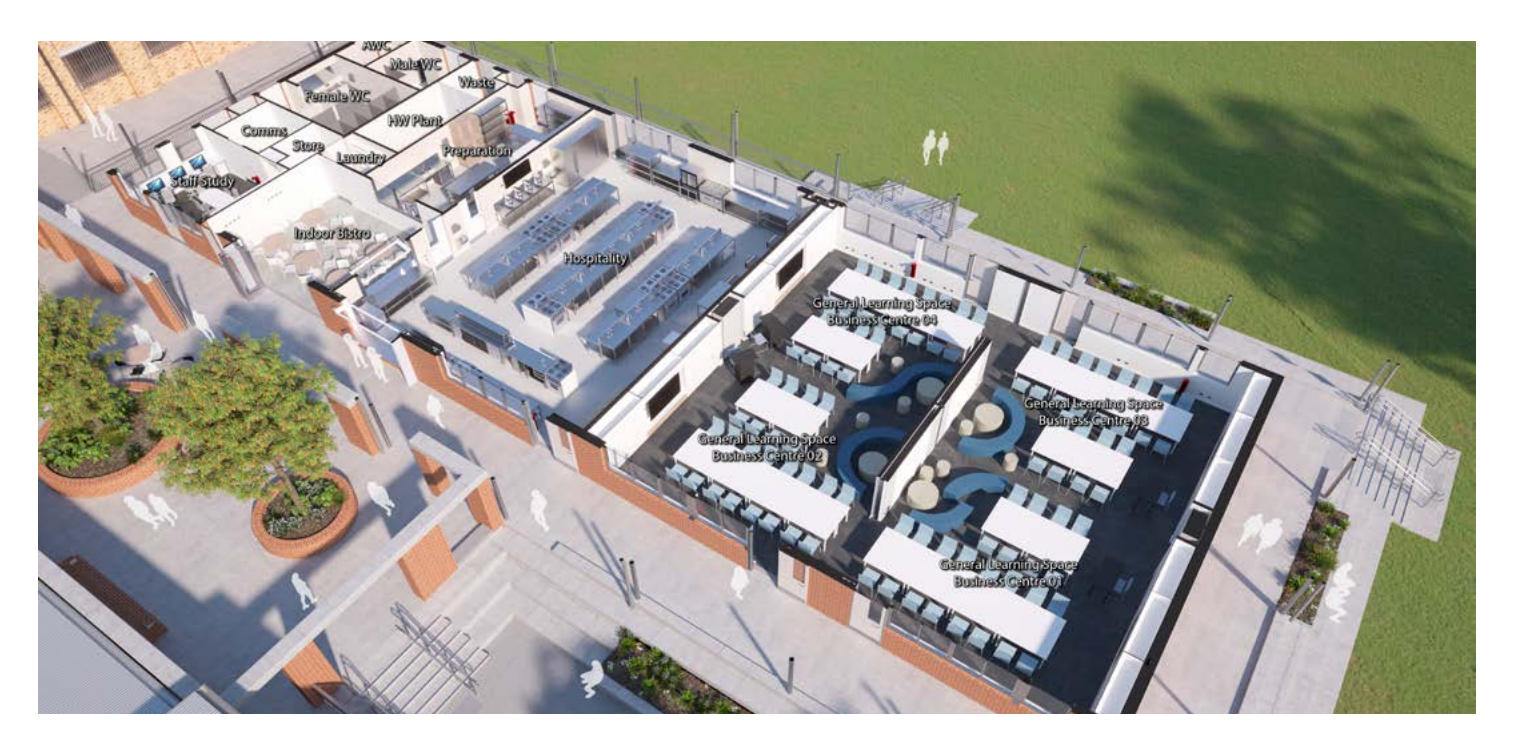
Artist impression of VET Hospitality – Commercial kitchen, Bistro spaces and business service spaces