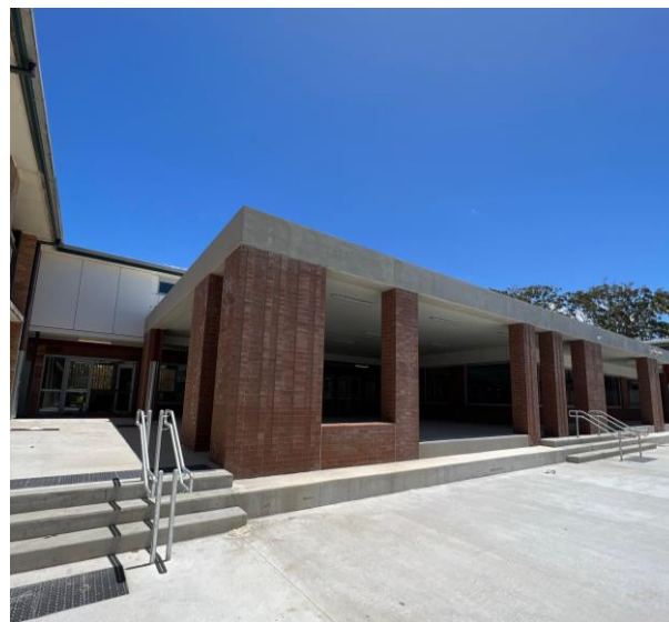
Exterior of new Building F