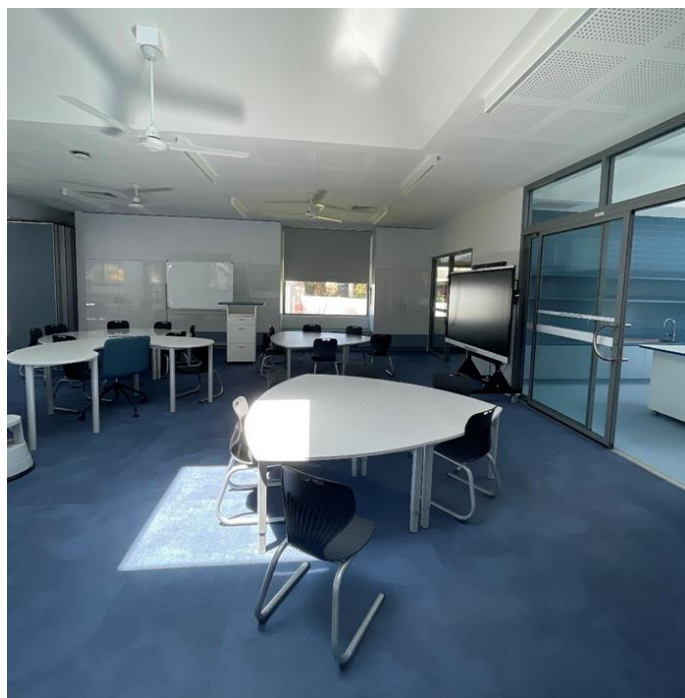
Building 2 interior