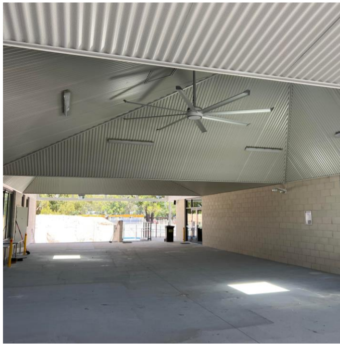
COLA at Building 2