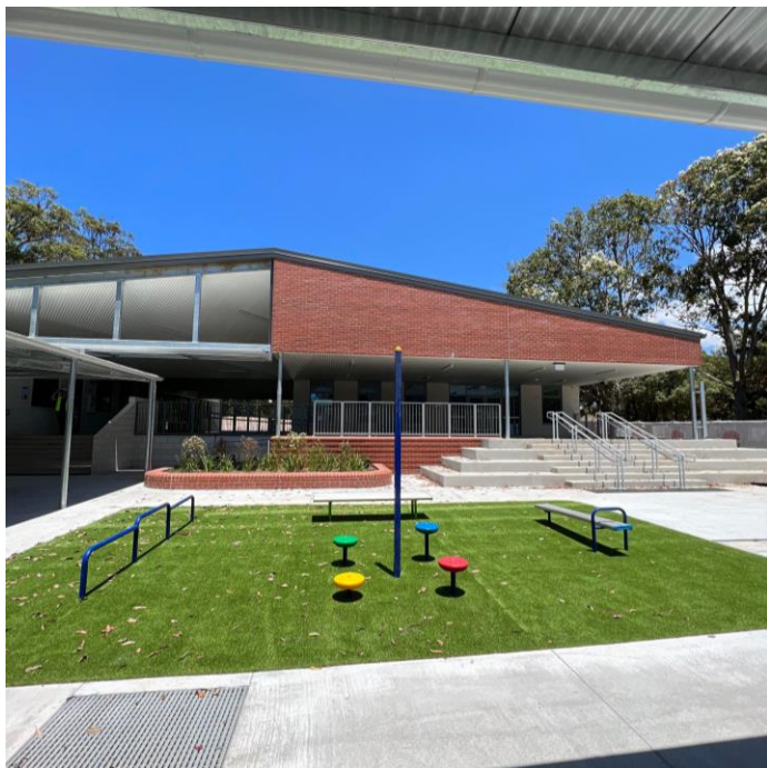
Building 2 exterior