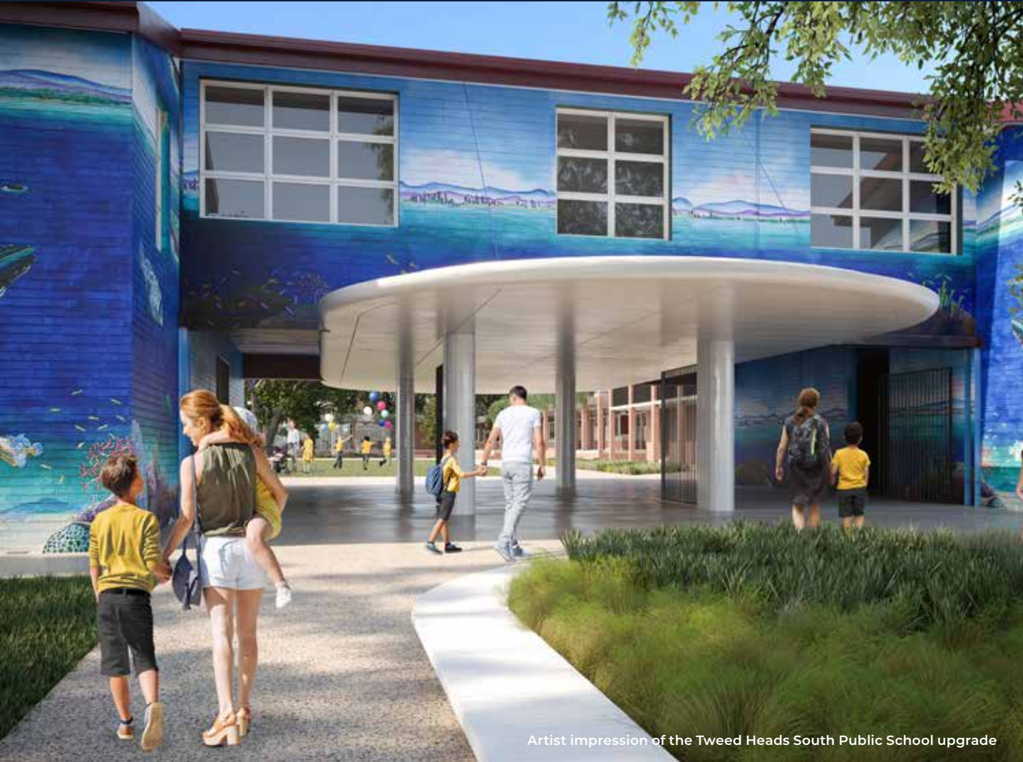
Artist impression of the Tweed Heads South Public School upgrade

A project is underway to upgrade Tweed Heads South Public School. The upgrade will include: