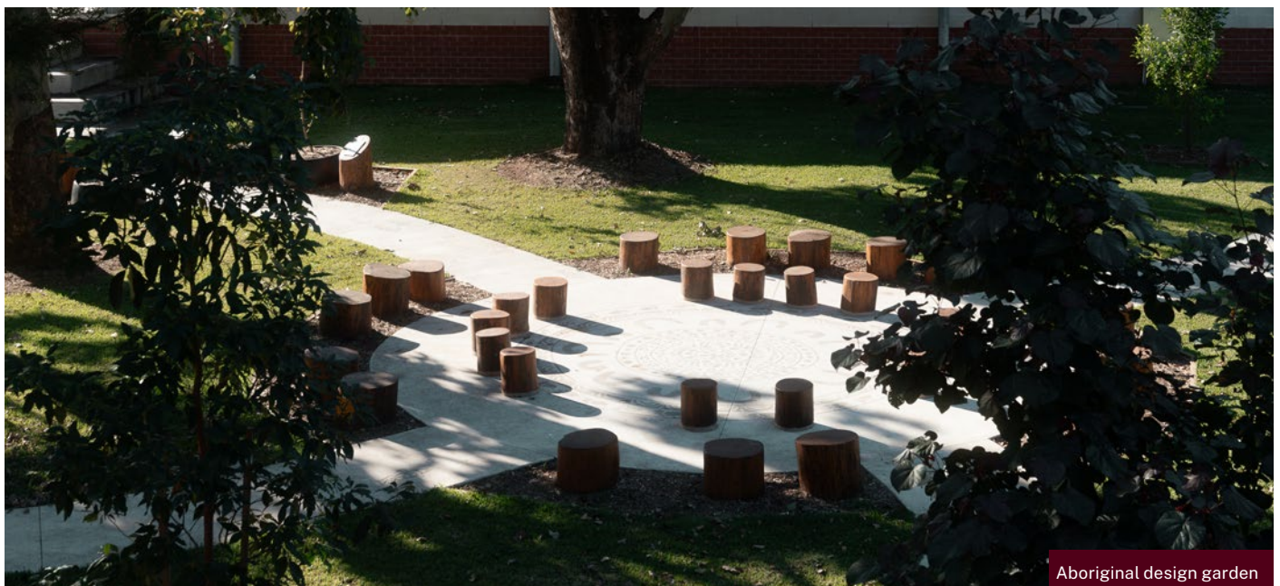
Aboriginal design garden