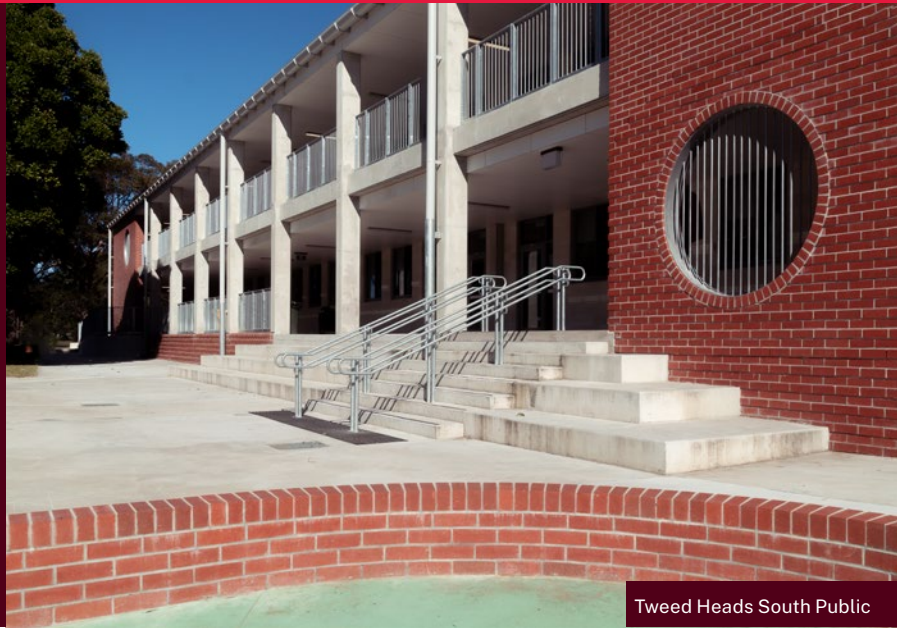
Tweed Heads South Public