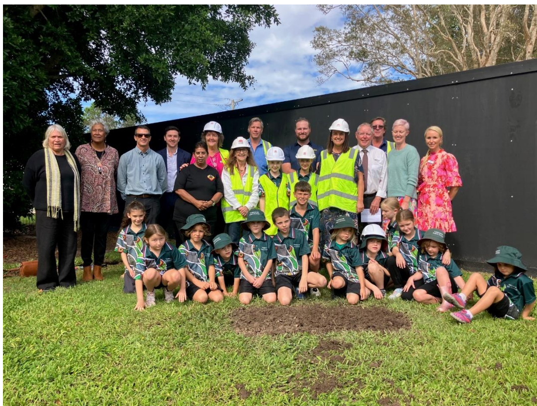
Tumbulgum Public School students, staff, and friends celebrating a big milestone!