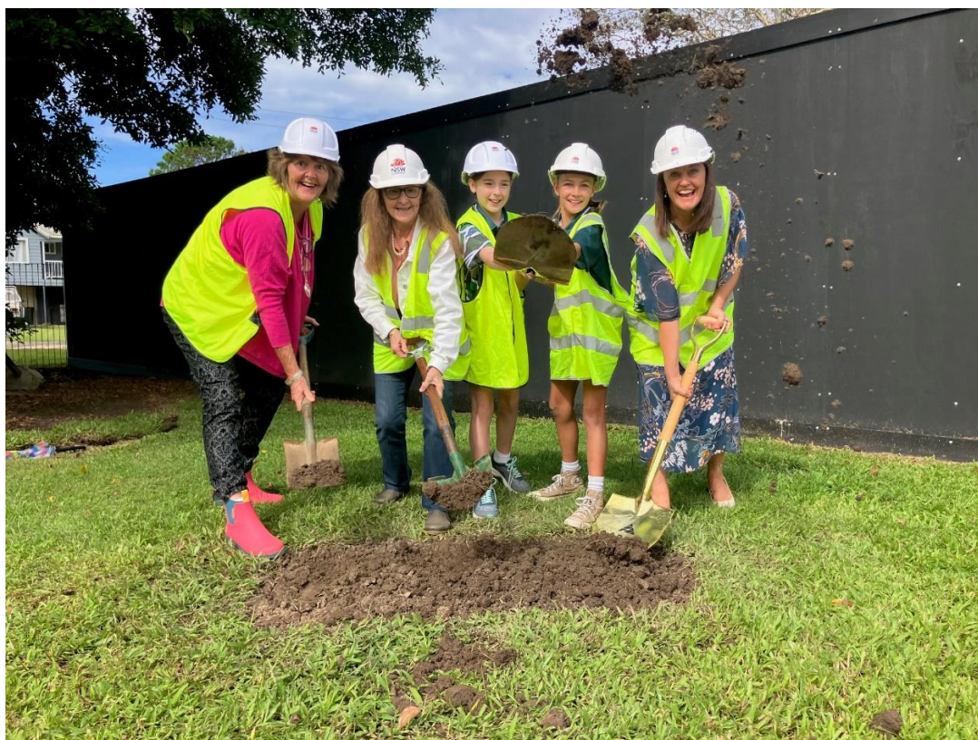
Turning the first sod to mark the start of construction at Tumbulgum Public School