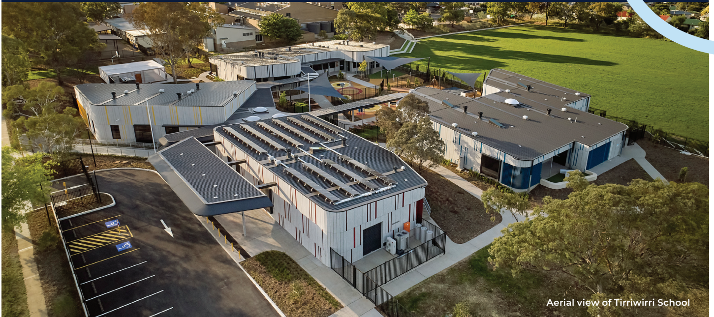
Aerial view of Tirriwirri School