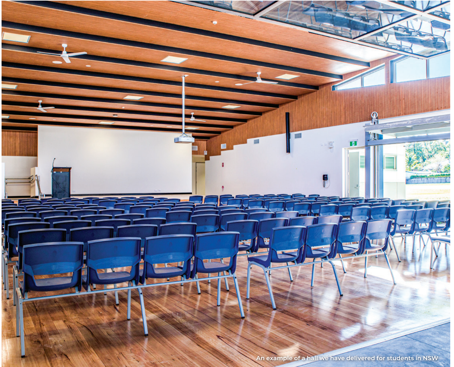
An example of a hall we have delivered for students in NSW