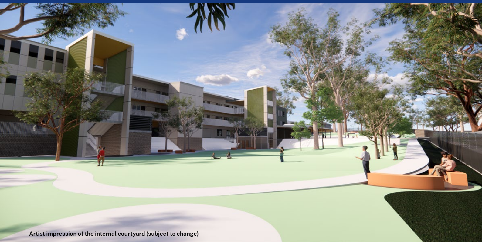
Artist impression of the internal courtyard (subject to change)