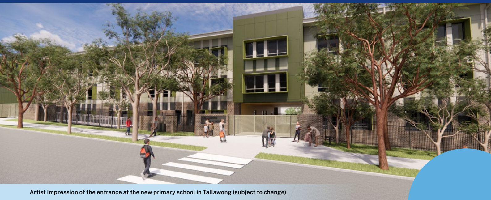
Artist impression of the entrance at the new primary school in Tallawong (subject to change)