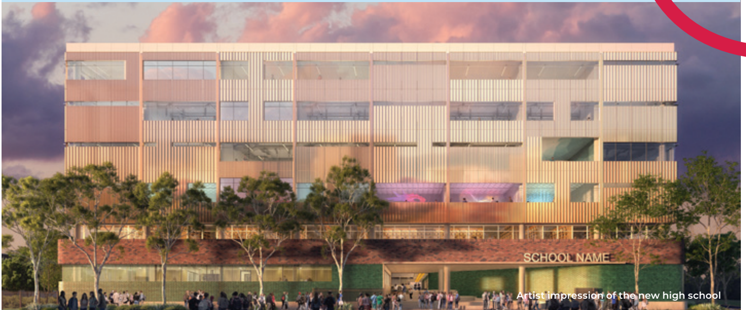
Artist impression of the new high school

The NSW Government is investing $7.9 billion over the next four years, continuing its program to deliver 215 new and upgraded schools to support communities across NSW. This is the largest investment in public education infrastructure in the history of NSW.