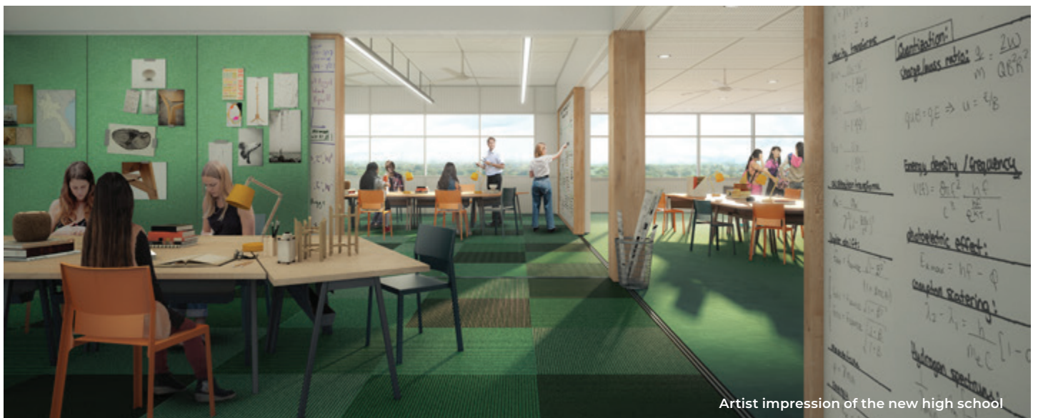
Artist impression of the new high school