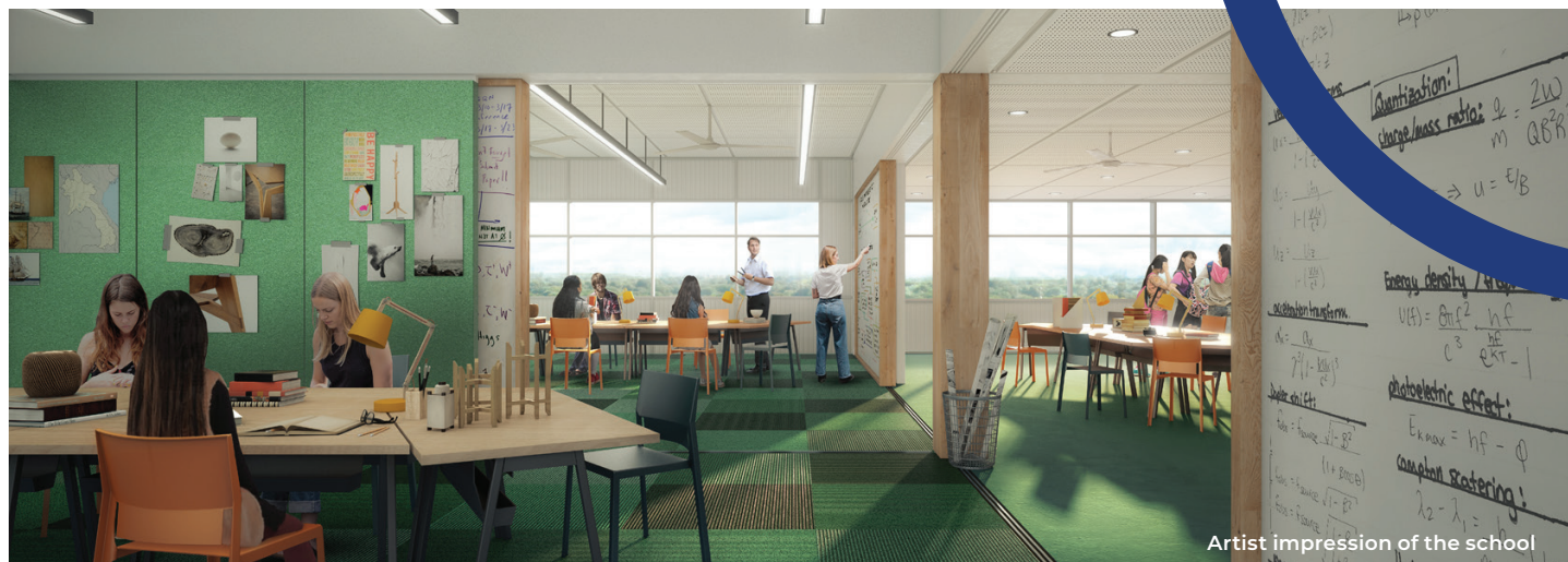
Artist impression of the school