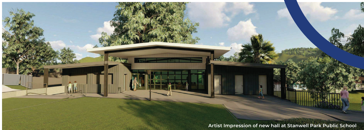
Artist Impression of new hall at Stanwell Park Public School