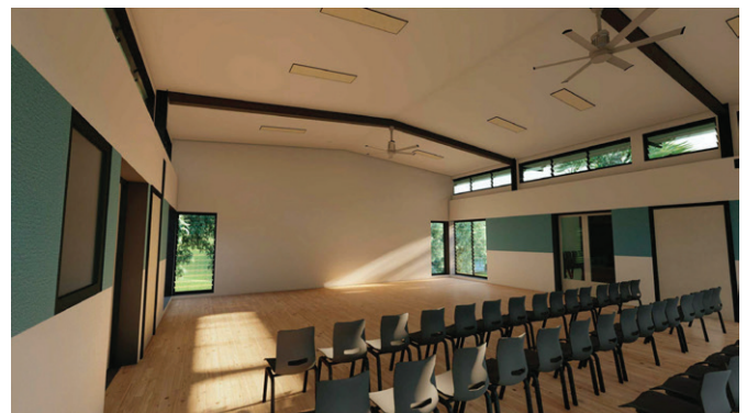
Artist impression of inside the hall

The Development Application for the new hall at Stanwell Park Public School will be available to view through the Wollongong Council webpage. You can comment on the application by providing a submission to council while it is on public exhibition.