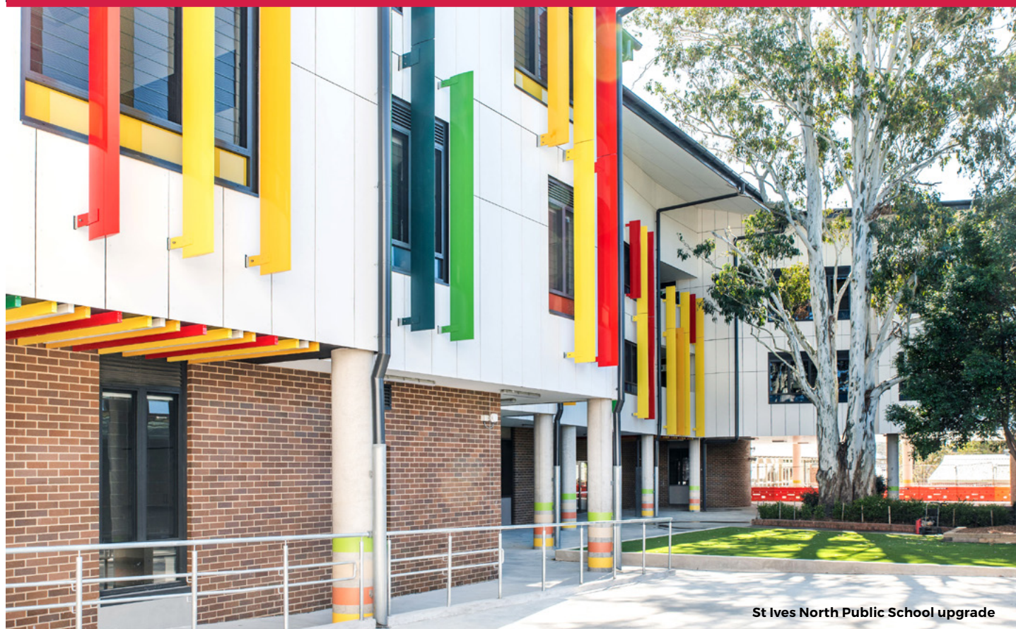
St Ives North Public School upgrade