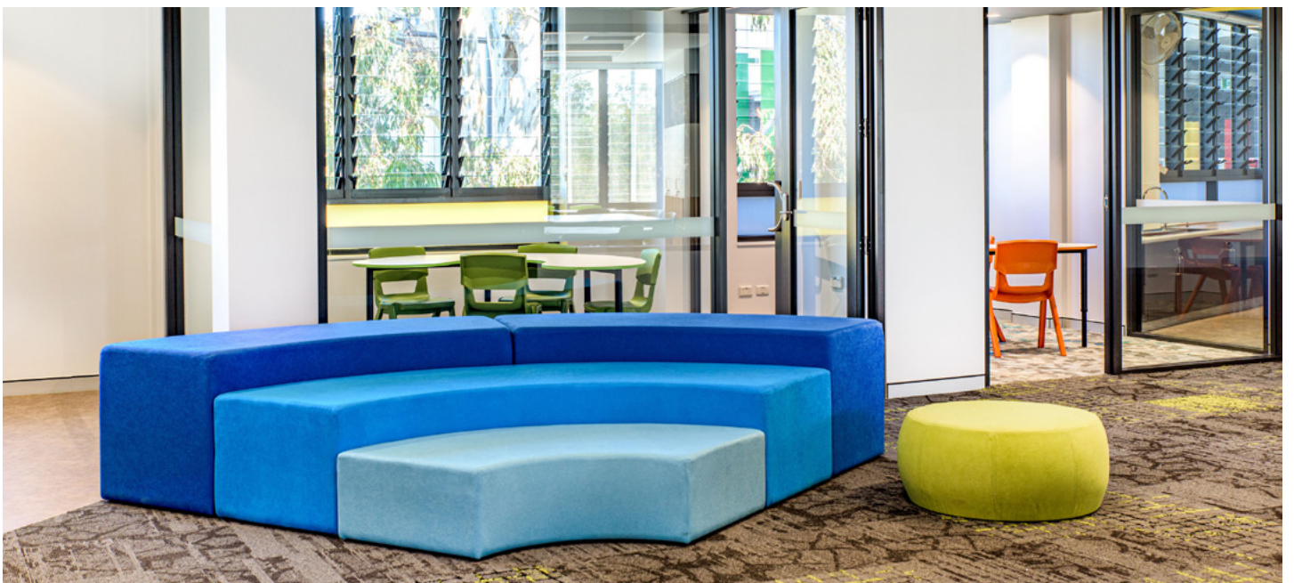
Innovative learning spaces at St Ives North Public School