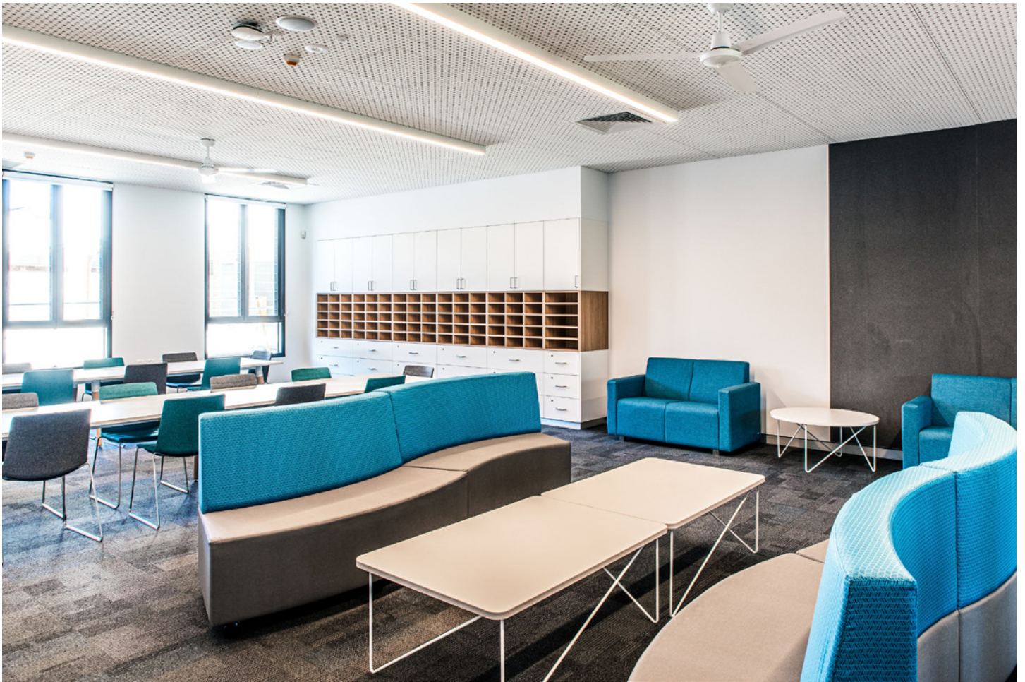
Innovative learning spaces at St Ives North Public School