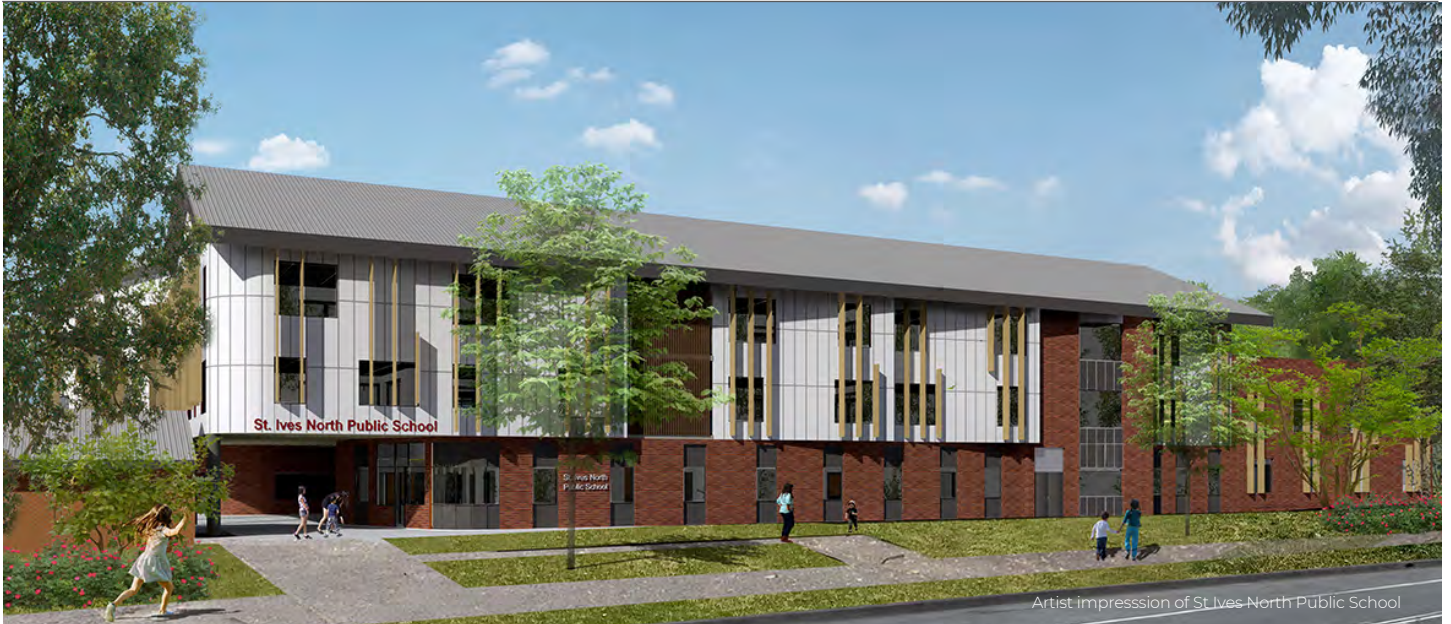
Artist impression of St Ives North Public School