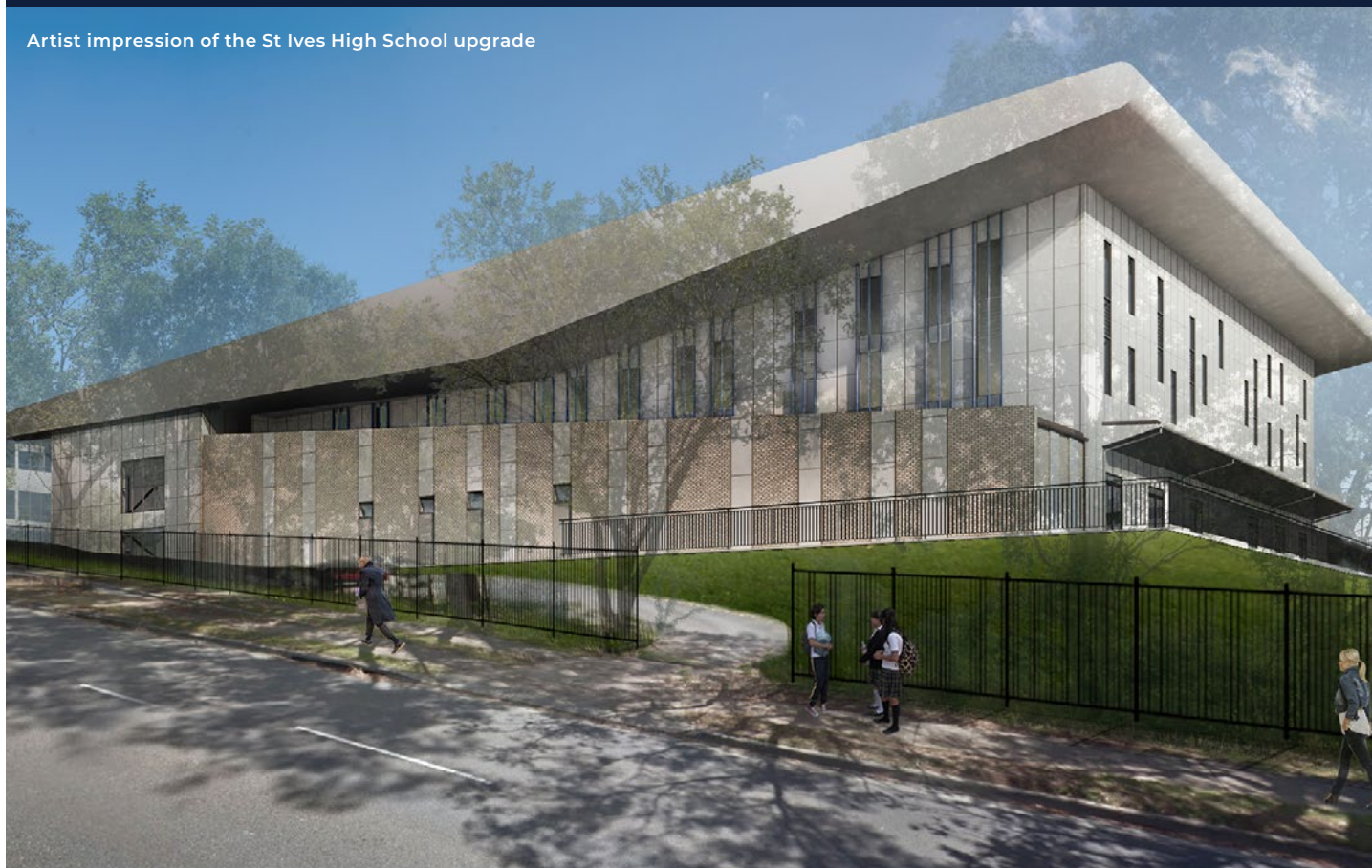
Artist impression of the St Ives High School upgrade

THE LARGEST INVESTMENT IN PUBLIC SCHOOL EDUCATION INFRASTRUCTURE IN THE HISTORY OF NSW