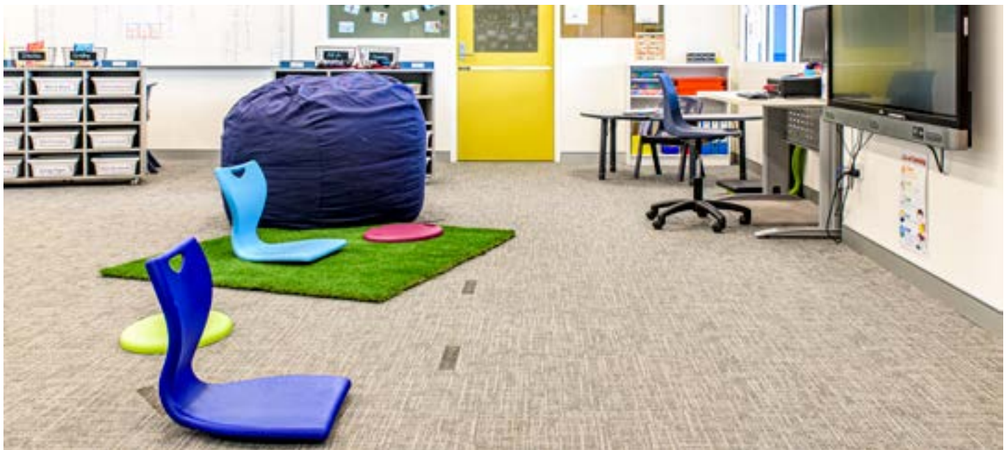
Innovative learning spaces at Speers Point Public School