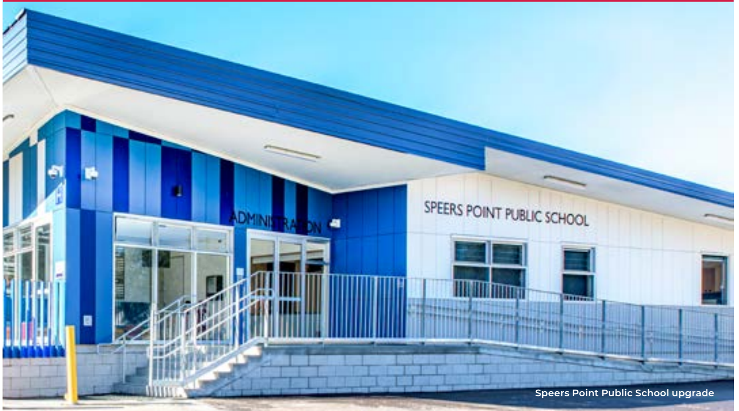
Speers Point Public School upgrade