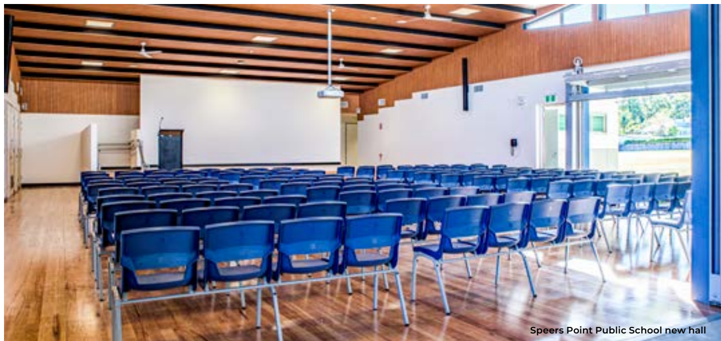
Speers Point Public School new hall