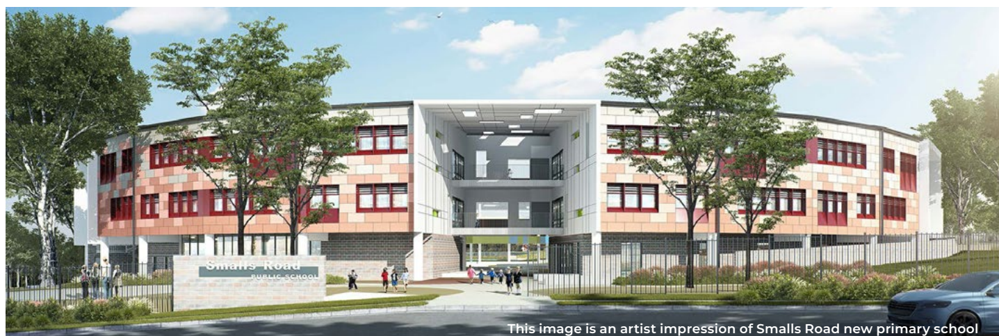
This image is an artist impression of Smalls Road new primary school