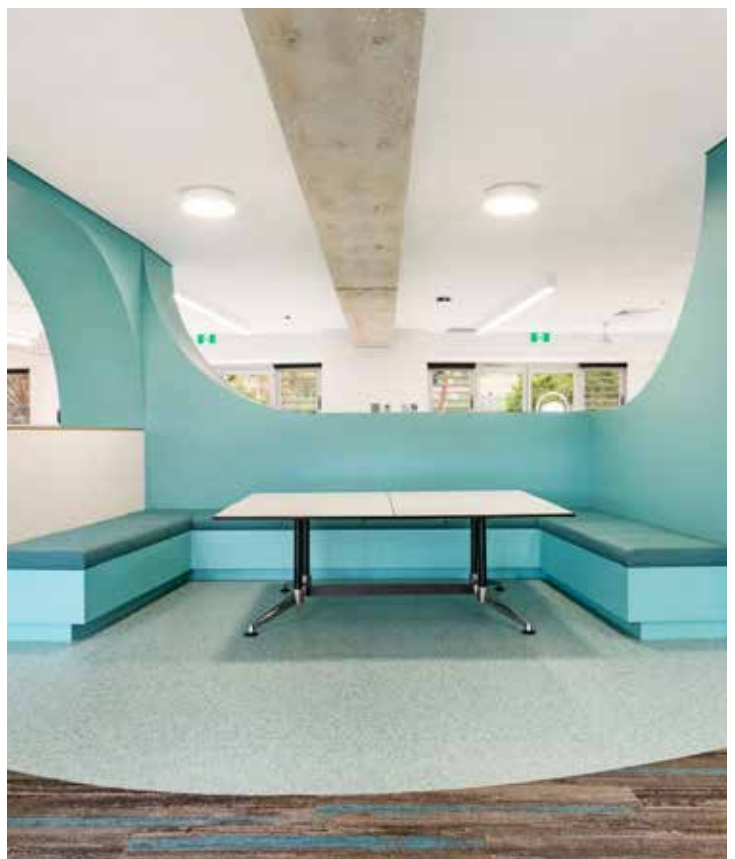
Innovative learning spaces