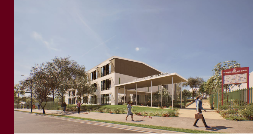
Image caption: Artist impression of the new school entrance on Turvey Street. Subject to change.