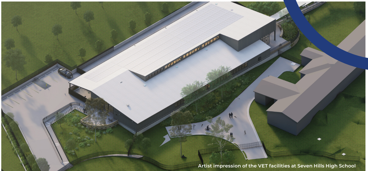
Artist impression of the VET facilities at Seven Hills High School