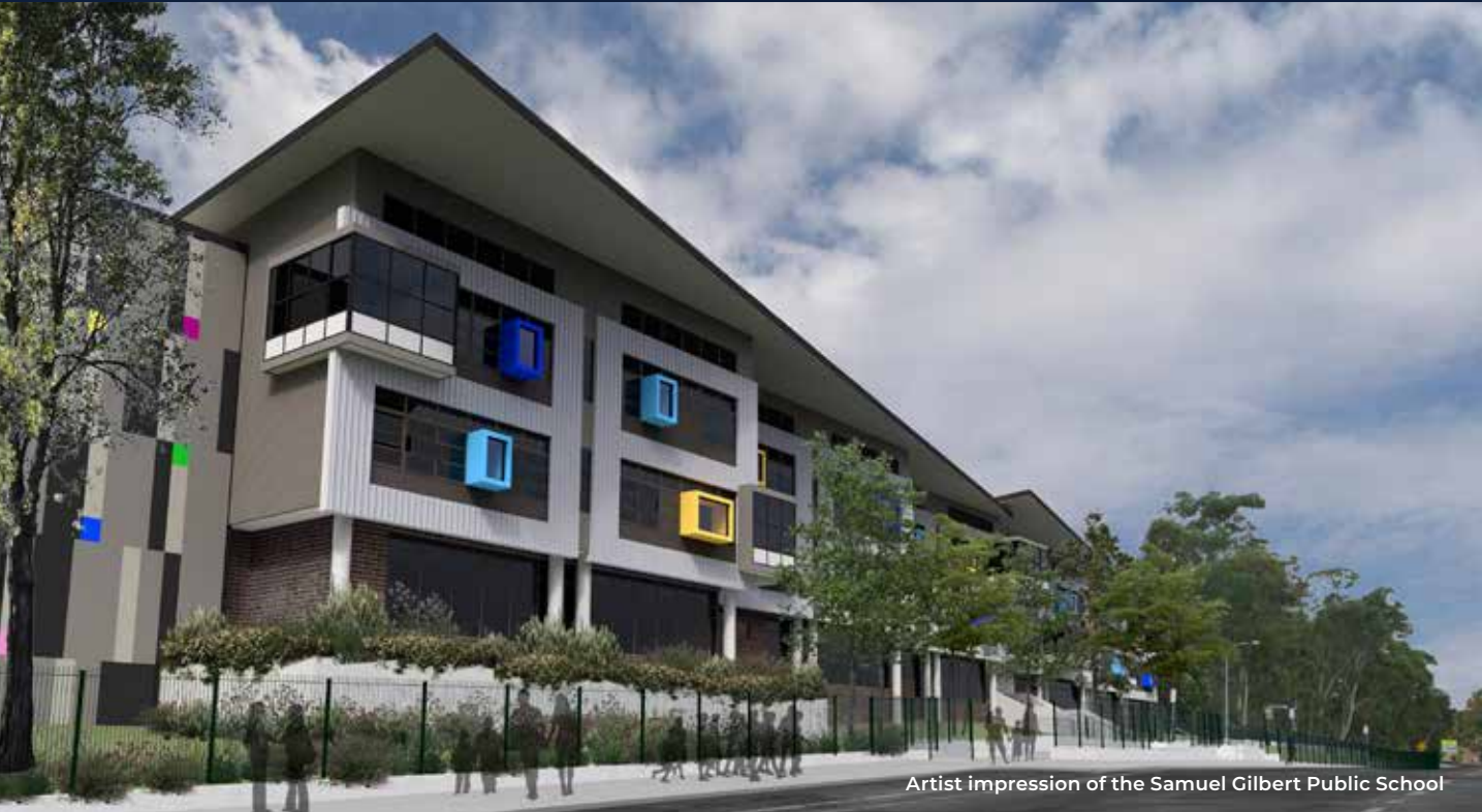
Artist impression of the Samuel Gilbert Public School

The NSW Government is investing $6.7 billion over four years to deliver more than 190 new and upgraded schools to support communities across NSW. In addition, a record $1.3 billion is being spent on school maintenance over five years. This is the largest investment in public education infrastructure in the history of NSW.