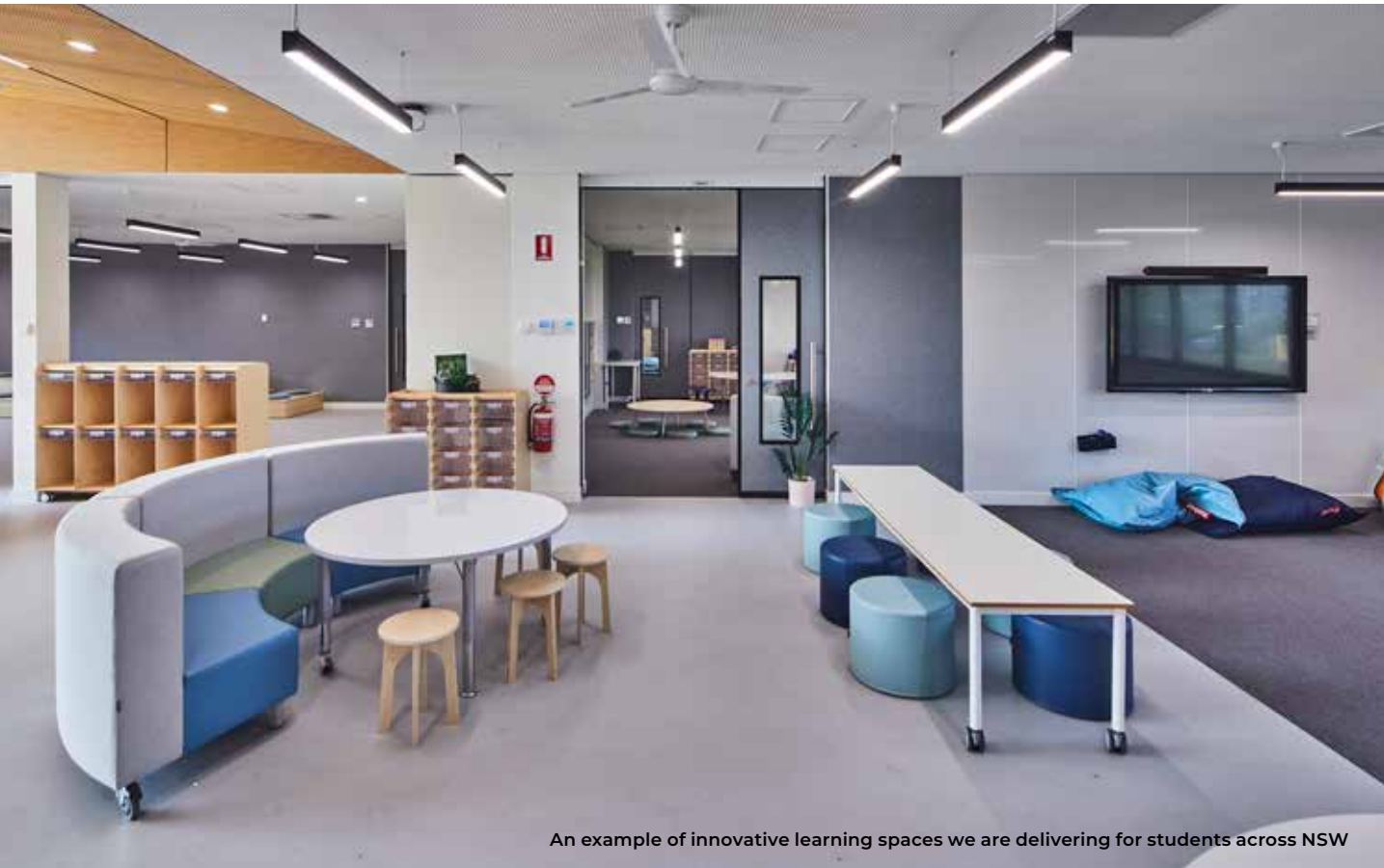
An example of innovative learning spaces we are delivering for students across NSW

We are committed to working together with the school community, local residents, and stakeholders to deliver the best possible learning facilities for students. We will continue to provide information through information drop-ins, project updates, work notifications, our project webpage, and school newsletters.