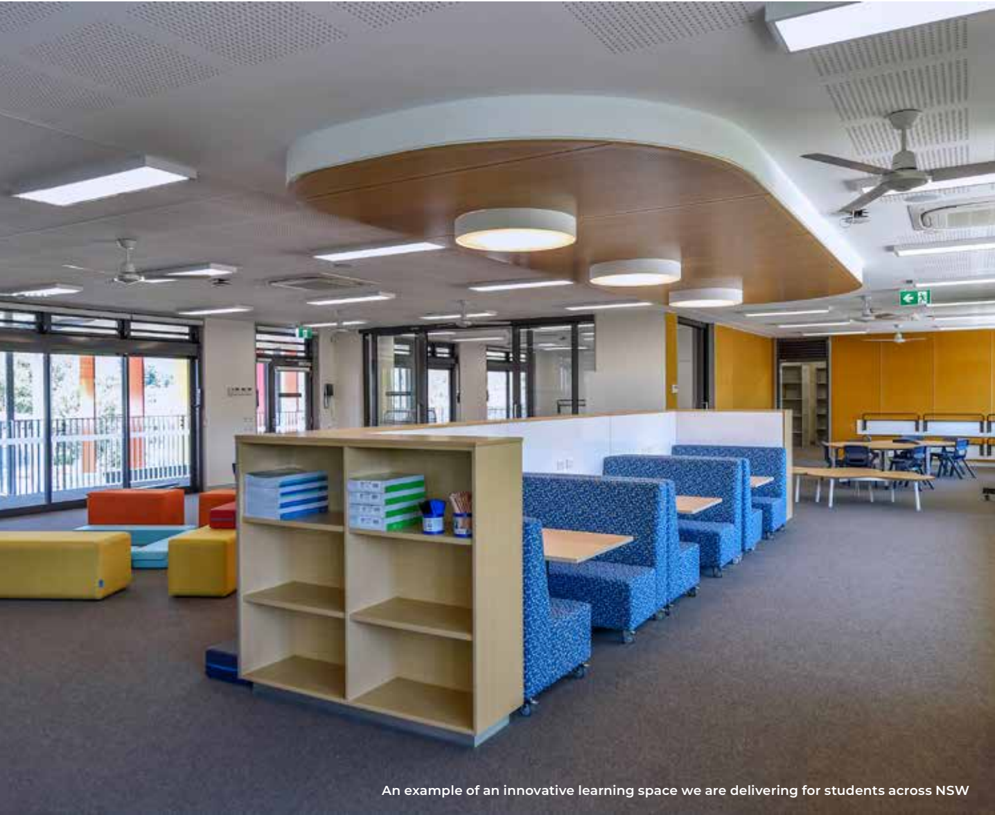
An example of an innovative learning space we are delivering for students across NSW