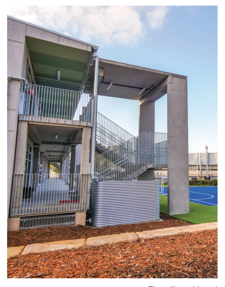
The pavilion and the oval