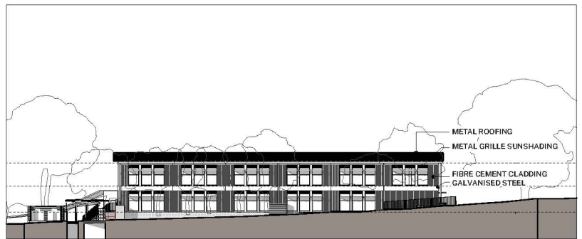
NE ELEVATION (FORREST RD)

SINSW is using modern methods of construction (MMC) to deliver new learning spaces for schools. Pavilions are manufactured offsite and then installed as complete modules onsite. The new approach cuts construction time by around 30 per cent and reduces carbon emissions, material waste and water waste on sites.