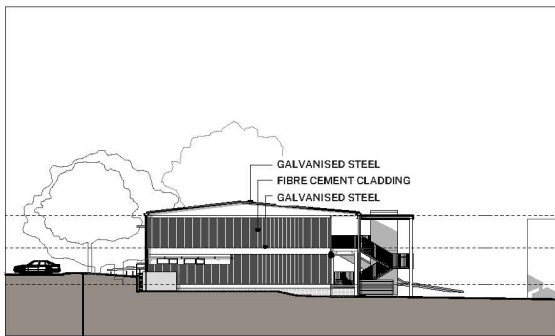
NW ELEVATION (MALVINA ST)

The drawings below show the pavilion building as viewed from the side and the front. The new building will have external stair, ramp and lift access. The designs are subject to change.