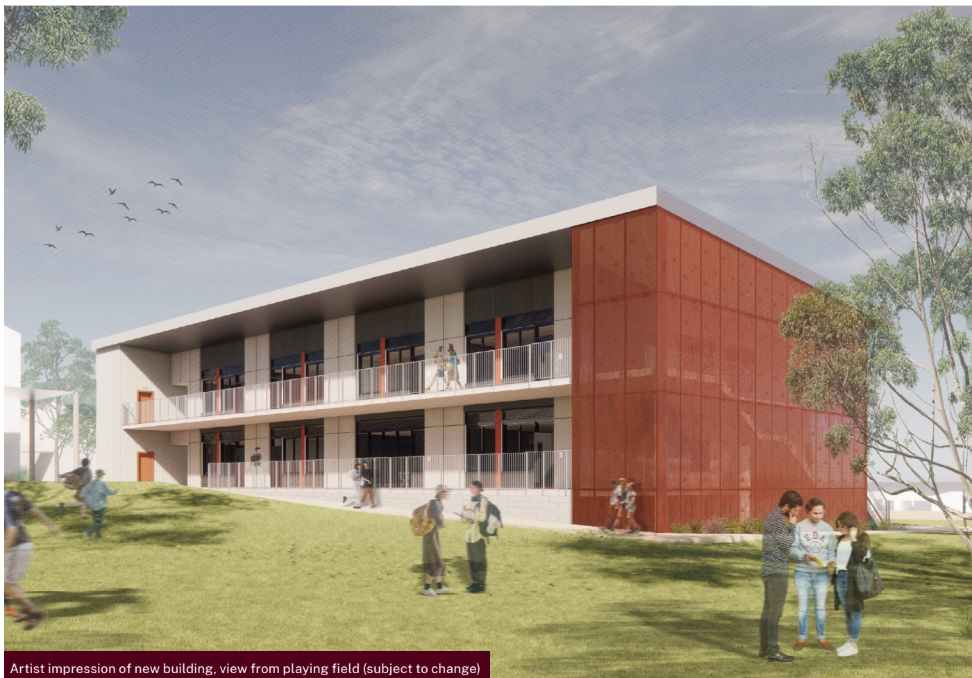
Artist impression of new building, view from playing field (subject to change)

The planning application will also be lodged soon. We will notify the community when the plans are on exhibition on the NSW Planning Portal ( planningportal.nsw.gov.au/part-5 ), and advise how you can view the plans and make a submission.