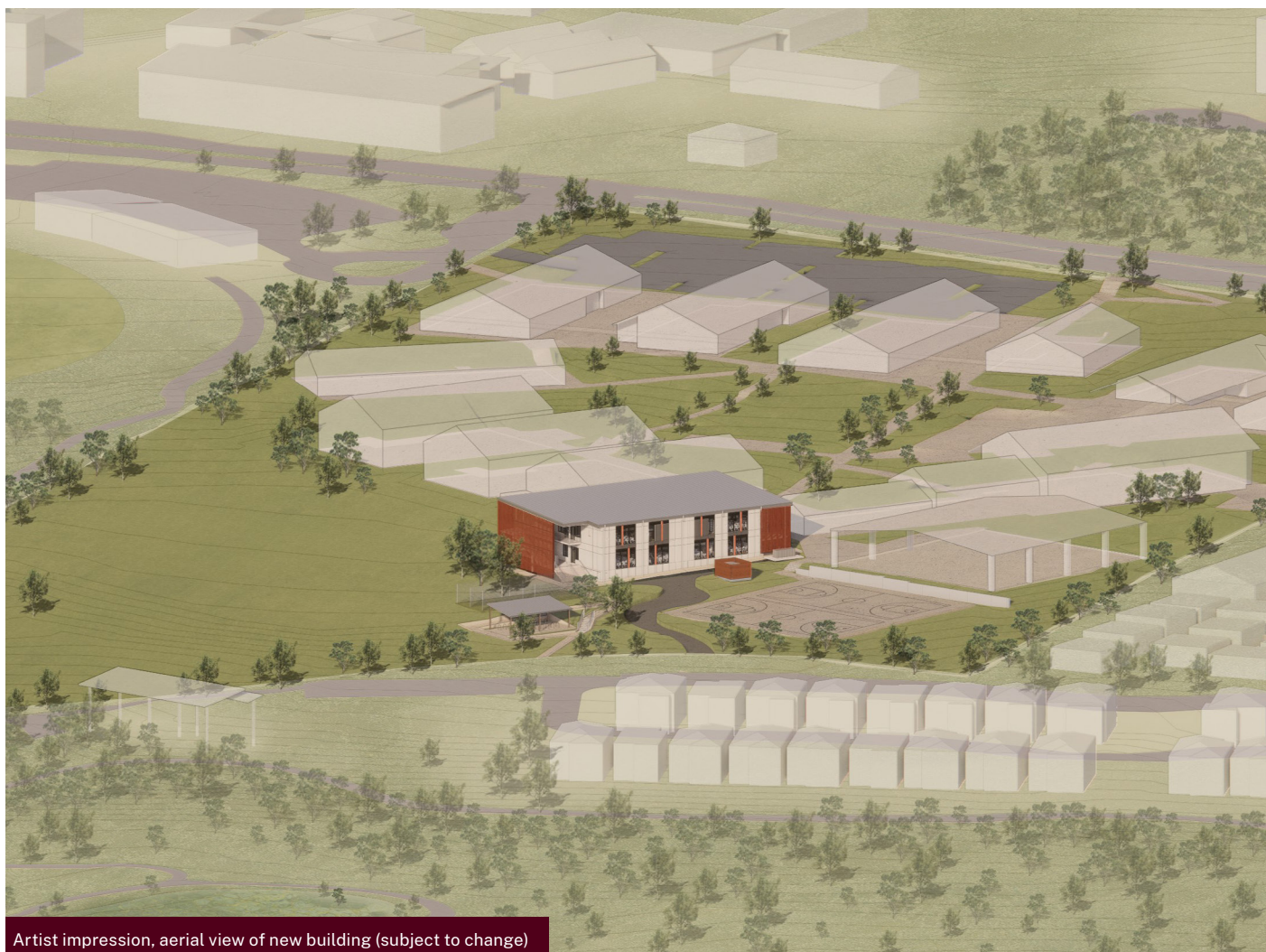
Artist impression, aerial view of new building (subject to change)