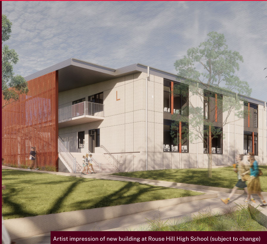
Artist impression of new building at Rouse Hill High School (subject to change)