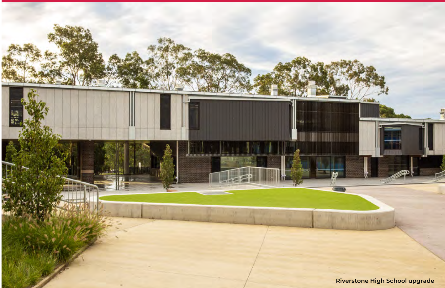
Riverstone High School upgrade

The Riverstone High School upgrade has now been completed. We have delivered: