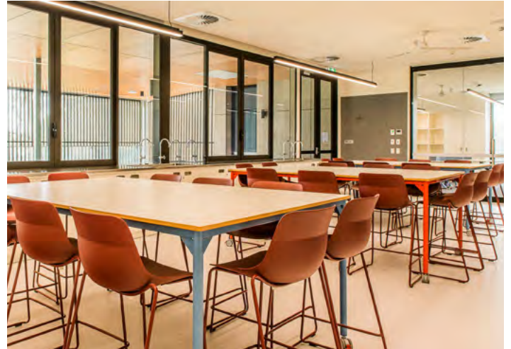
Riverstone High School upgrade