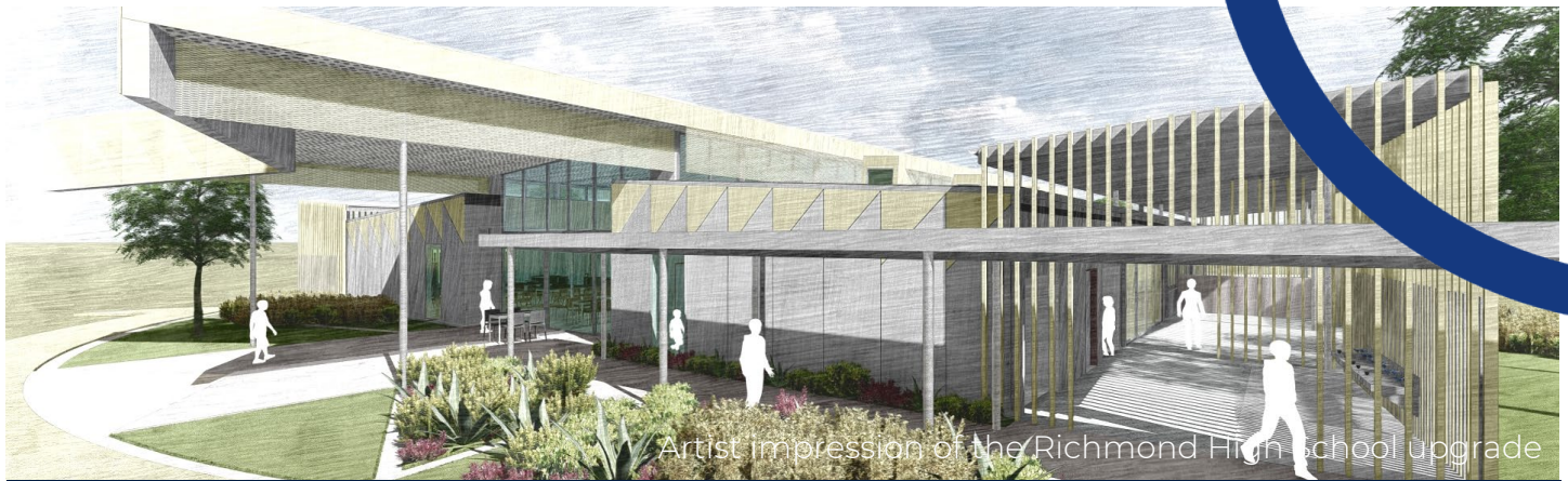
Artist impression of the Richmond High School Upgrade