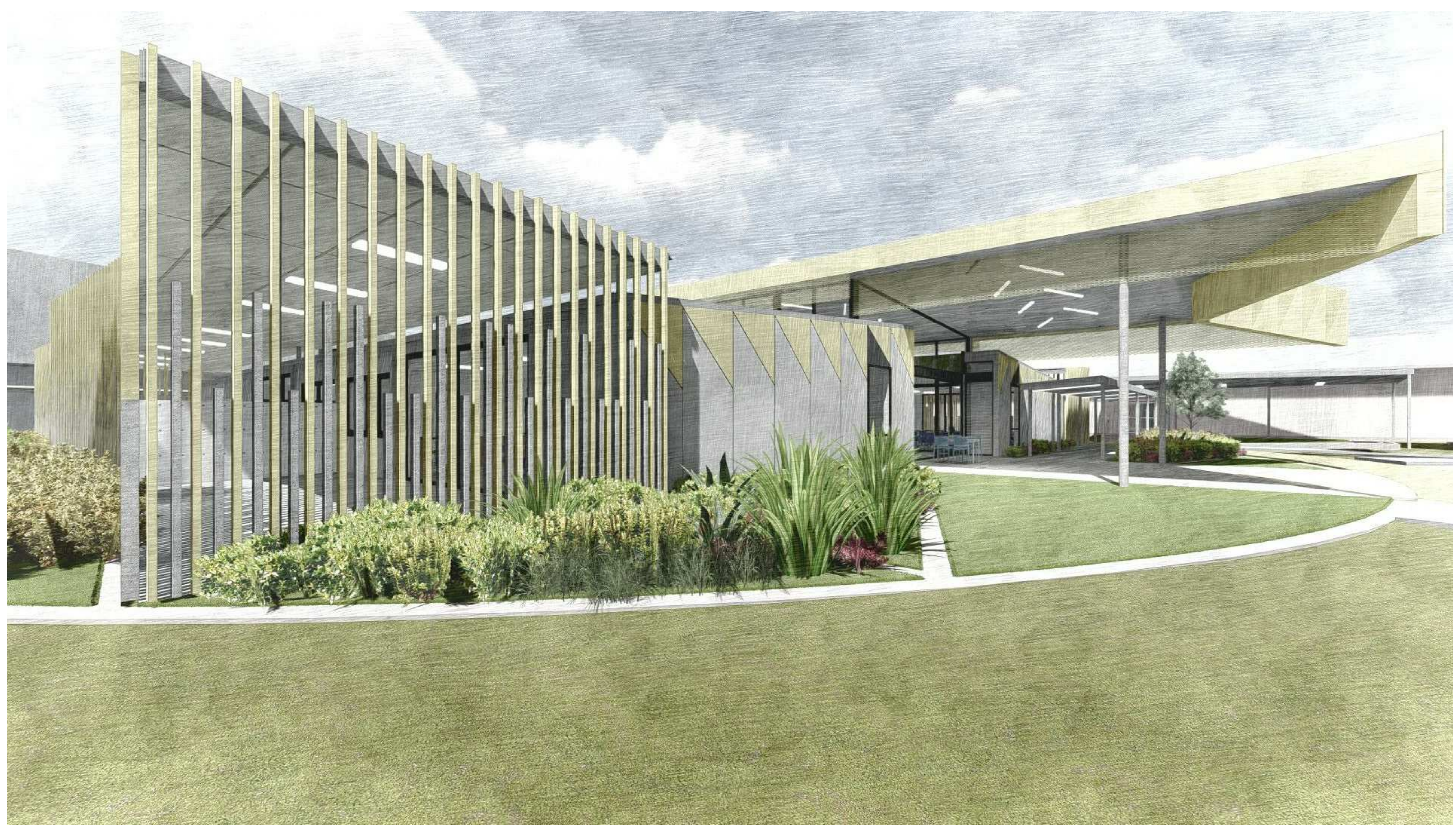
PERSPECTIVE 1 - VIEW FROM NORTH