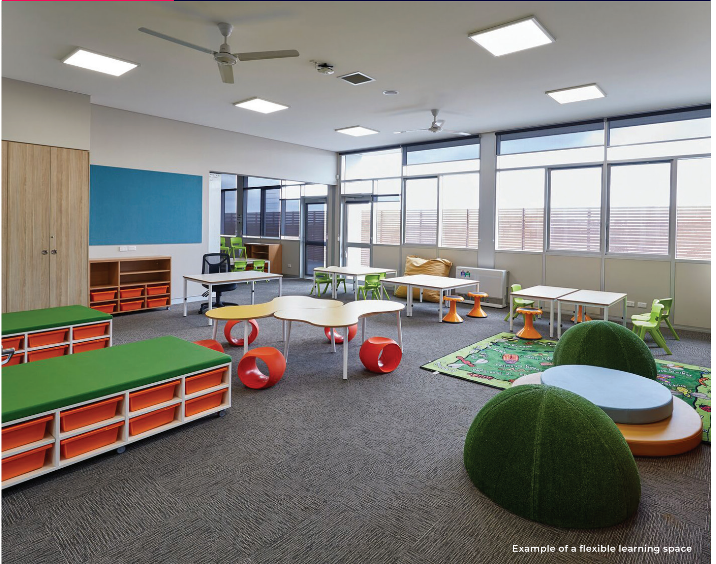
Example of a flexible learning space