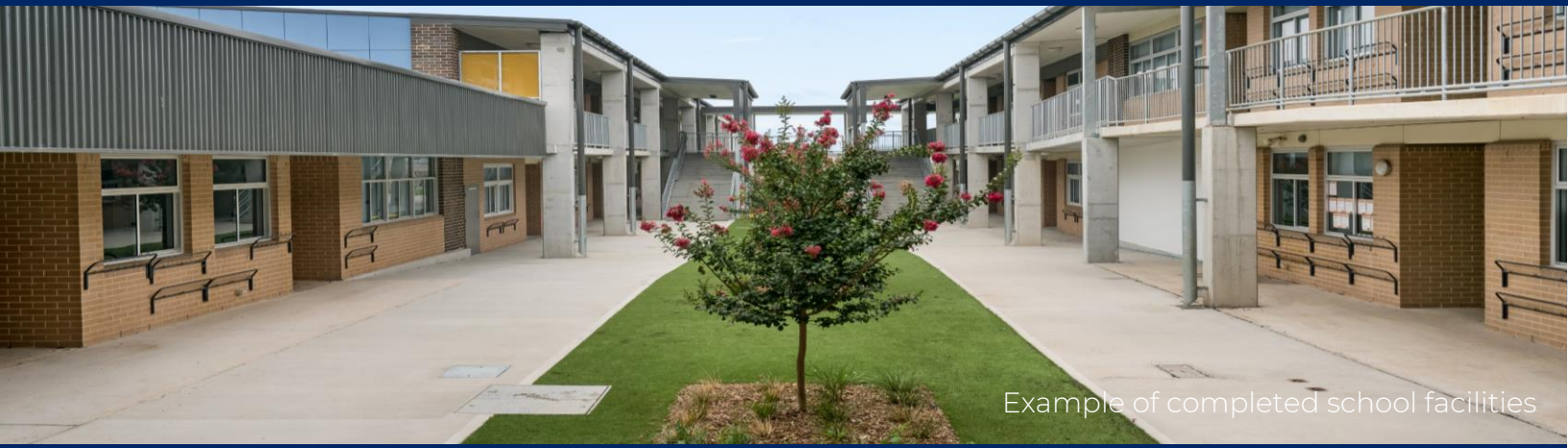
Example of completed school facilities