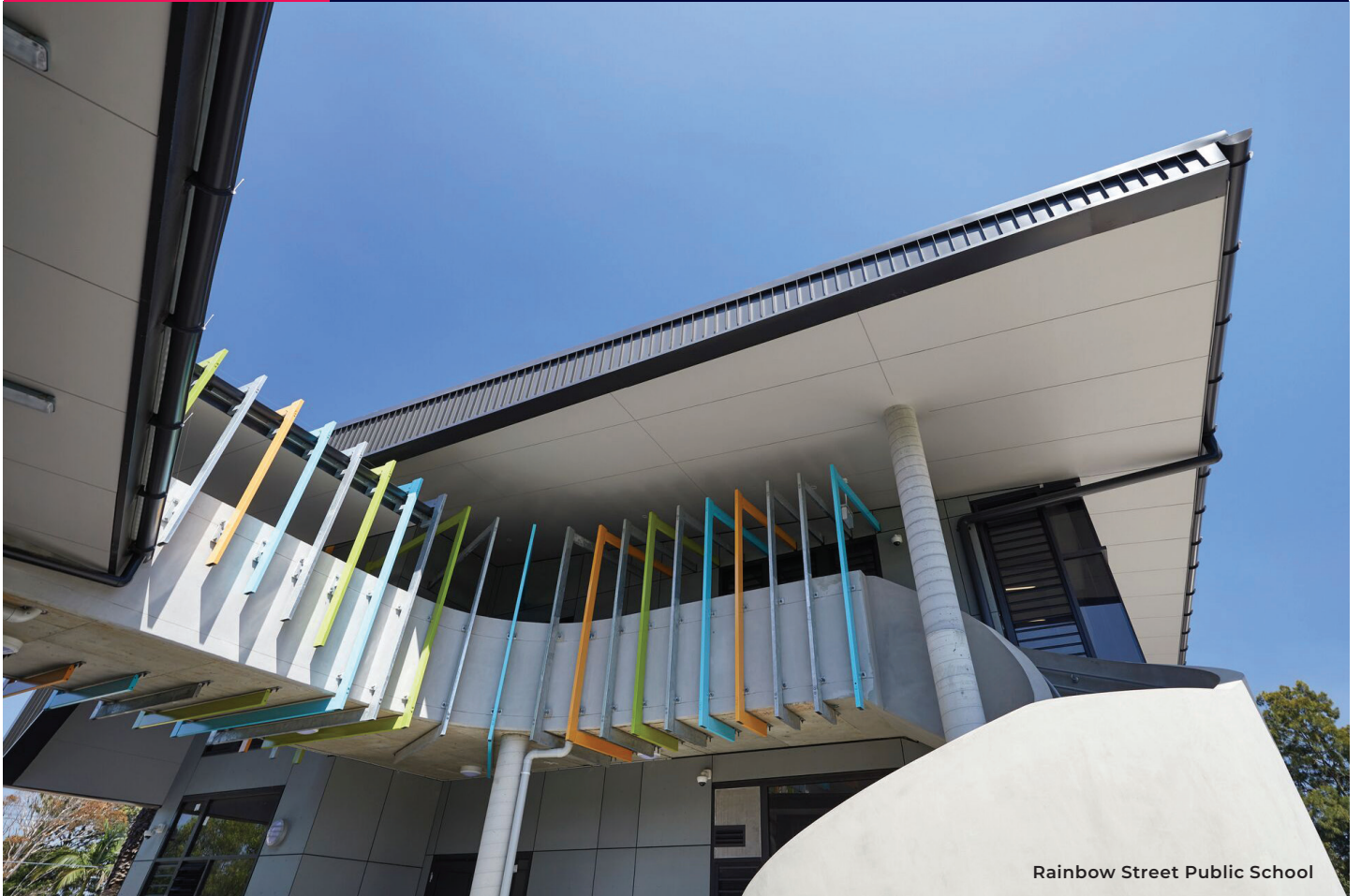
Rainbow Street Public School