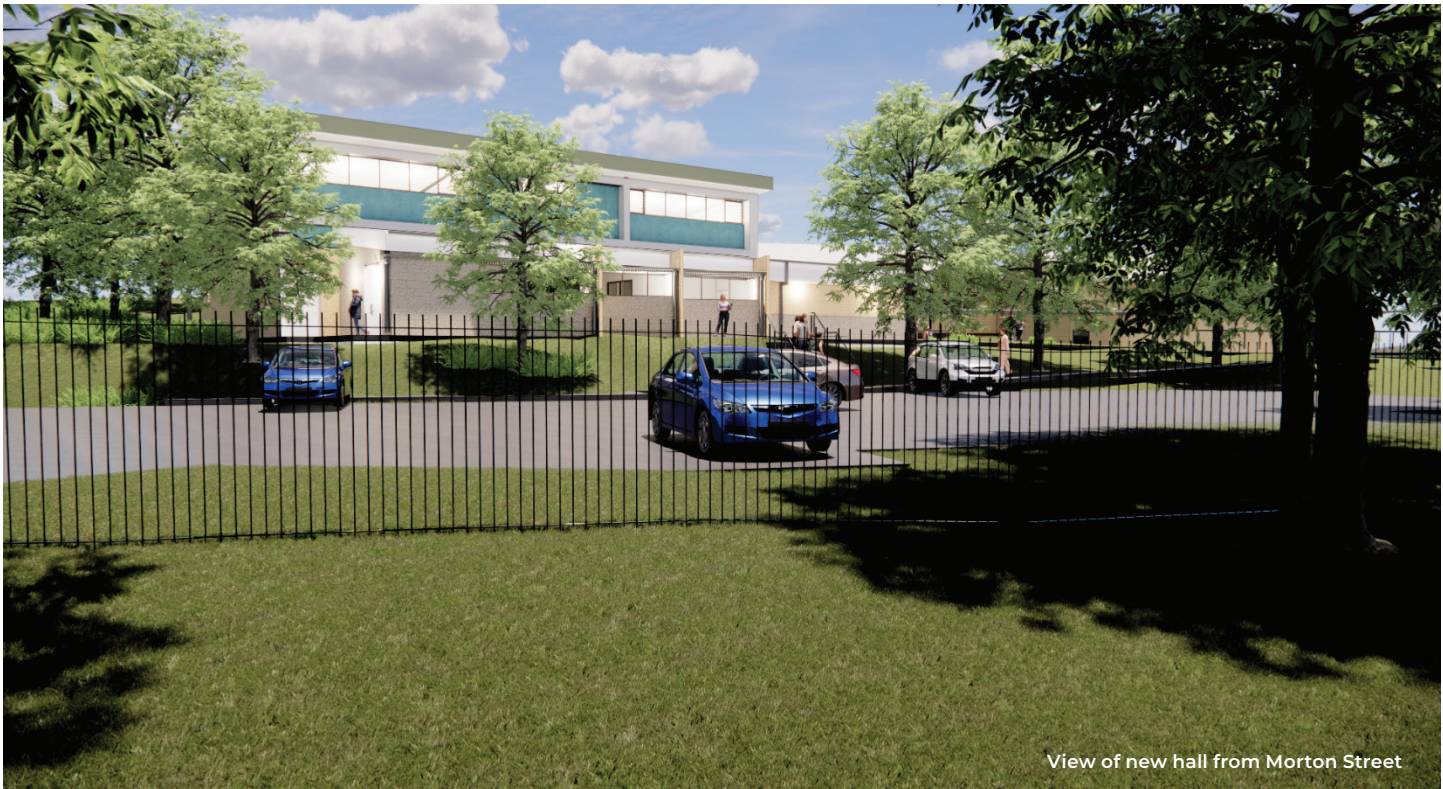
View of new hall from Morton Street