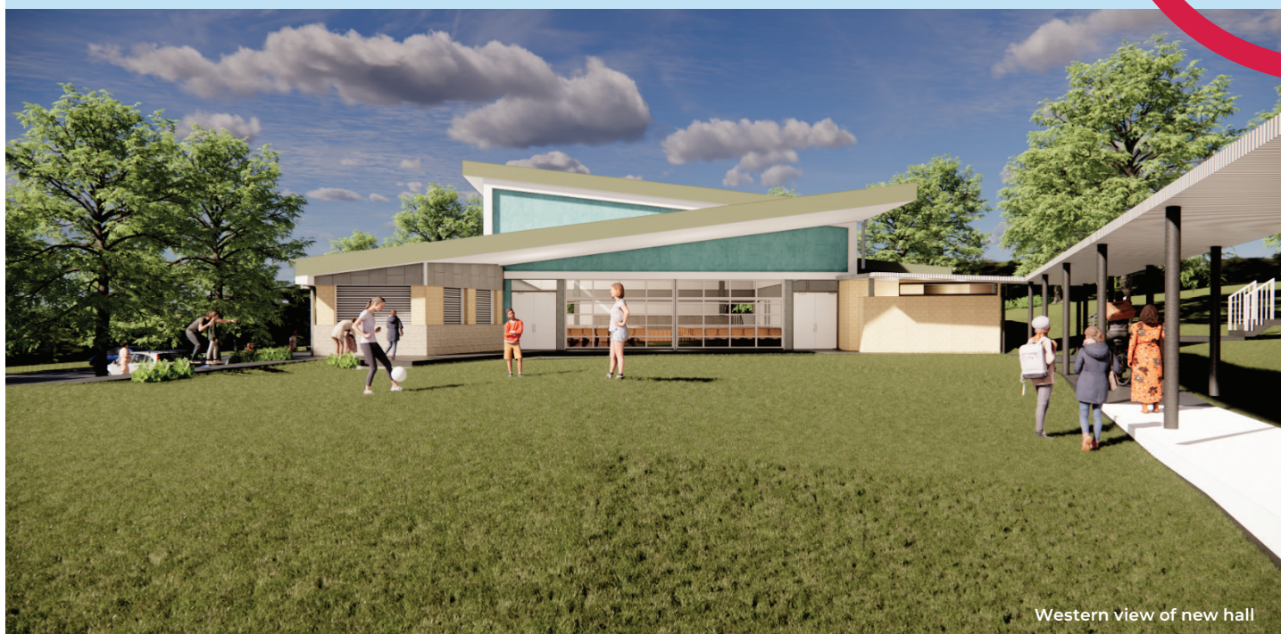
Western view of new hall

The NSW Government is investing $8.6 billion in school infrastructure over the next four years, continuing its program to deliver 160 new and upgraded schools to support communities across NSW. This builds on the more than $9.1 billion invested in projects delivered since 2017, a program of $17.7 billion in public education infrastructure.