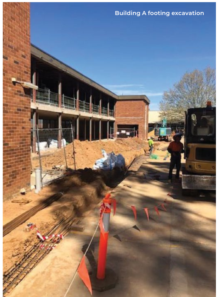
Building A footing excavation

The new learning spaces are designed to facilitate innovative learning. Innovative learning spaces are designed to be flexible and well-resourced so that teachers can design a wide range of learning activities to develop the skills and knowledge of students.