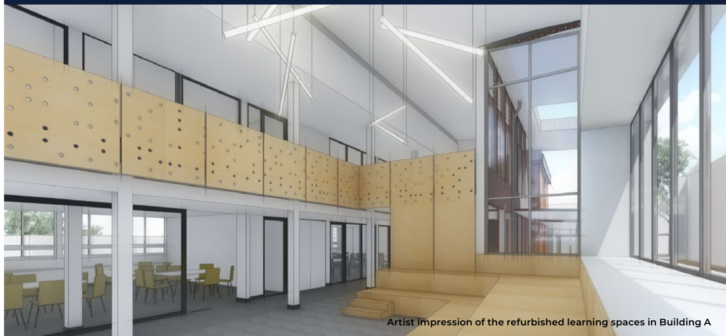
Artist impression of the refurbished learning spaces in Building A

The NSW Government is investing $6.7 billion over the next four years to deliver 190 new and upgraded schools to support communities across NSW.