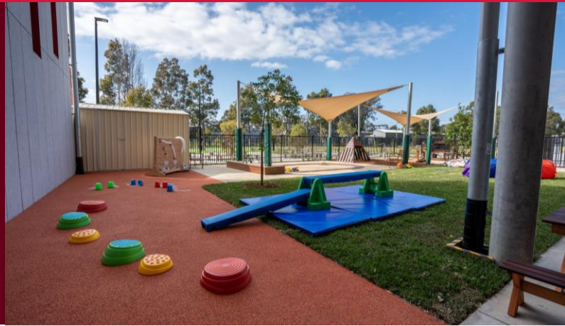
Image caption: Example of the play space of a new public preschool.