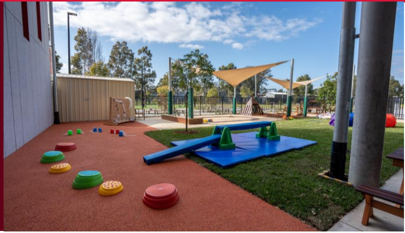
Image caption: Example of the play space of a new public preschool.