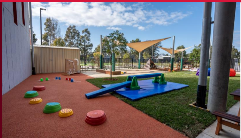
Image caption: Example of the play space of a new public preschool