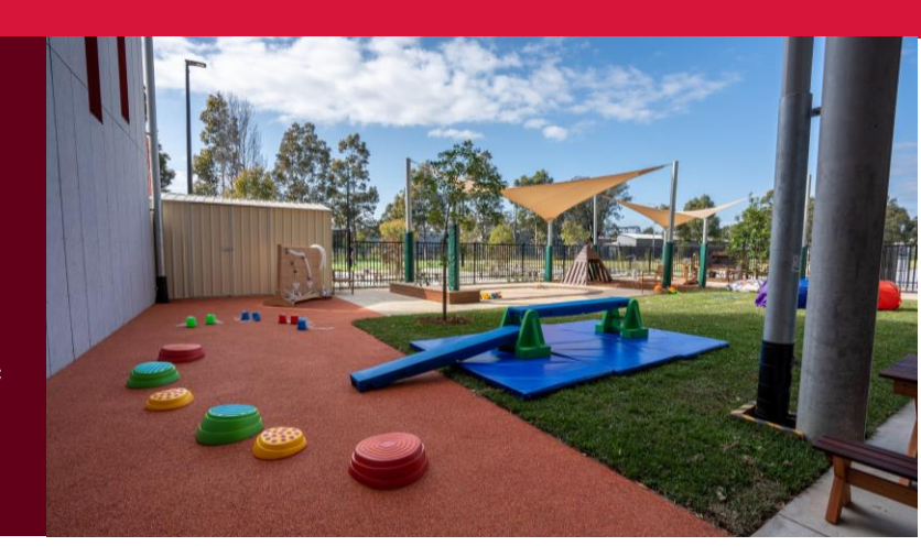
Image caption: Example of the play space of a new public preschool.