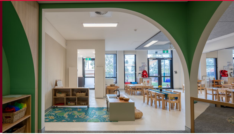
Image caption: An example of the interior of a new public preschool.