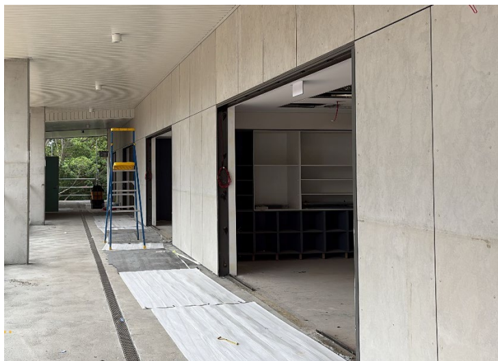
Level 1 balcony to the new classrooms