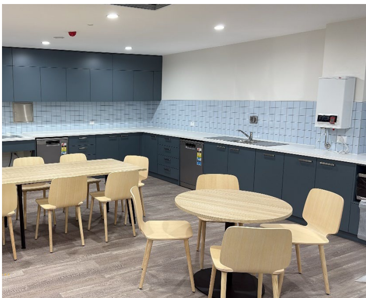
Staff room kitchen and amenities