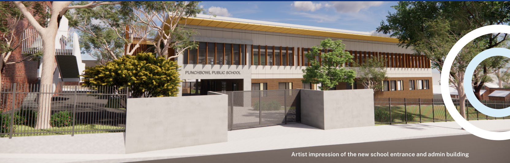
Artist impression of the new school entrance and admin building