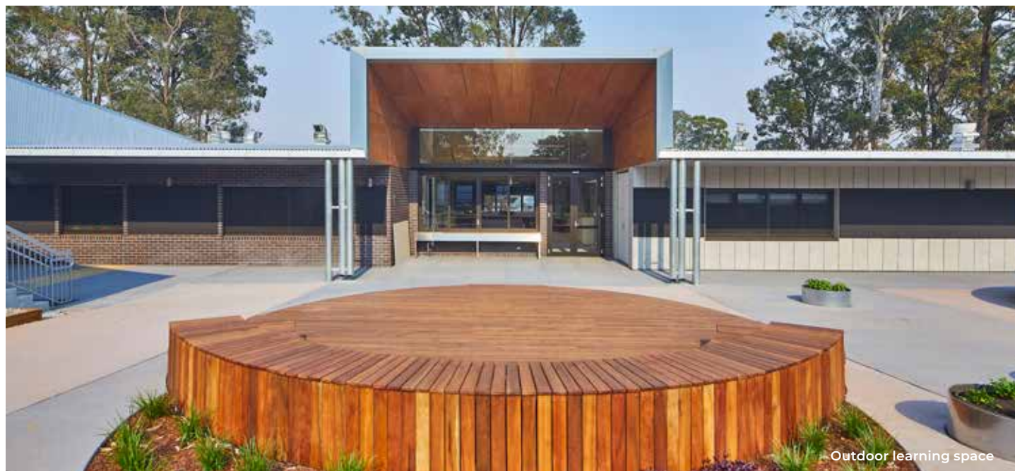
Outdoor learning space