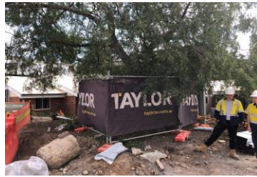
Tree Protection Zone Adjacent Bldg 'B'