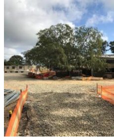
Tree protection Zone looking from Bldg 'A' towards Bldg 'B'