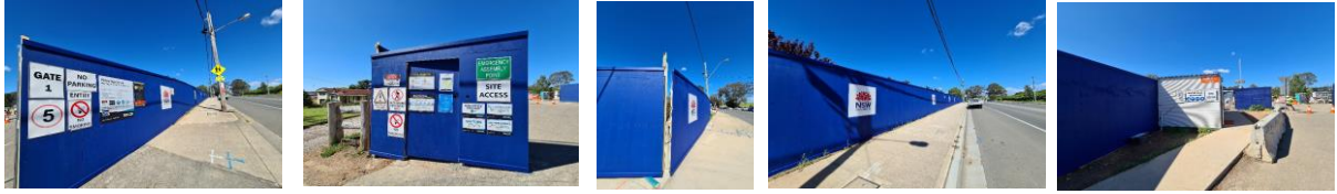
Photos of Hoarding on Aryle Street, Picton NSW taken on 28 September 2020