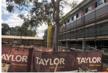
Tree Protection Zone Adjacent Bldg 'A'