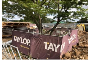
Tree protection Zone Middle of Future Open Area North of Bldg 'A'